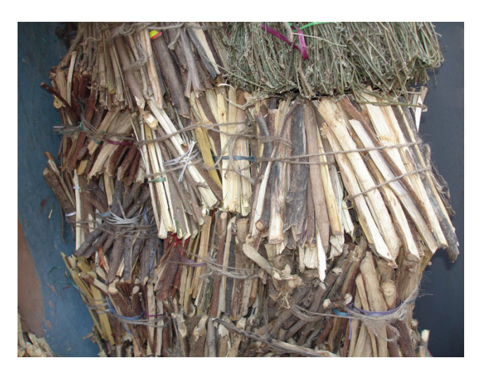
Figure 5 Bundles of ethnotaxa (Nagarasi, Veeraii, Thillai, Vellerugu, Thazahi, Vagai etc.) stored and traded for use as ethnomedicine.

Collections of ethnotaxa (Kannupila, Pannaipoo, Veppan, Avarai and Nochi etc.) for sorting and distribution within the community or trading with other communities.