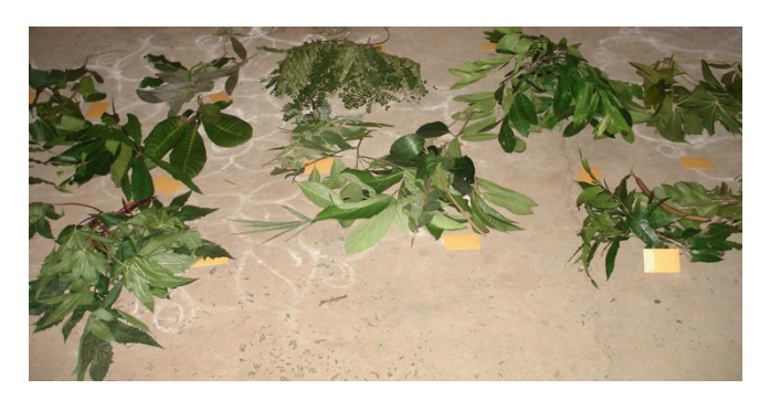
Figure 2 Sorting of ethnotaxa by the informants.