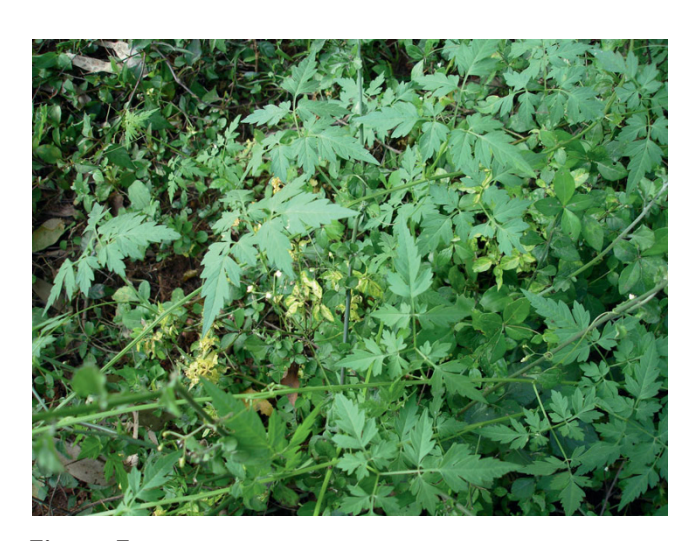
Figure 7 'Mudakkathan' ancient remedy for 'Moottu vadham' (rheumatoid arthritis).

supplement for some families from impoverished communities of third world countries. The paradox is that Cardiospermum halicacabum is a poisonous (contains cyanide) invasive plant that agricultural researchers have described as a noxious weed that must be globally eradicated. We are currently investigating genetic variation among the haplotypes of Cardiospermum halicaca bum and the complex cryptic taxonomy, which consists of several ethnotaxa.