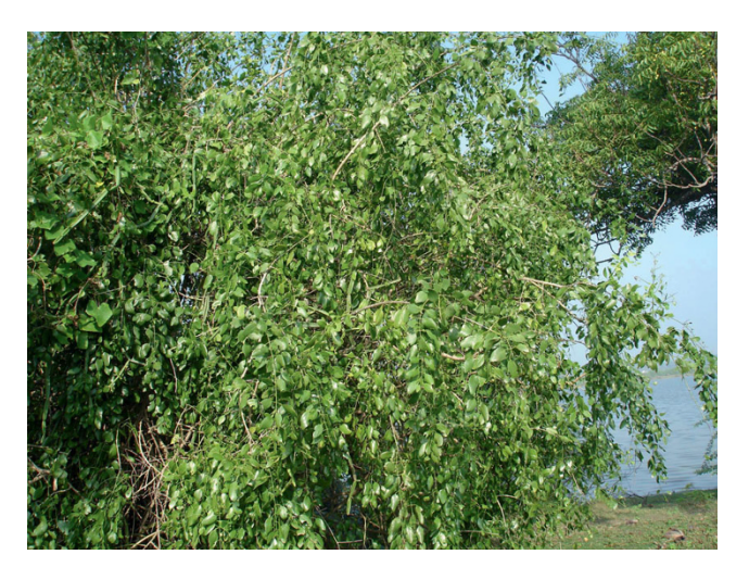
Figure 6 'Vagai' and ancient remedy for 'Moottu vadham' (rheumatoid arthritis).

The Irulas treat ' Moottu vadham ' (rheumatoid arthritis) with at least two different ethnotaxa, including ' Vagai ' (Figure 6) and ' Mudakkathan ' (Figure 7) both of which have a high consensus factor for the Irulas ( F_{ic} = 1.0 ) within this study and by Malasars ( F_{ic} = 0.78 ) [37]. The Malasars treat rheumatic pain using two other plants, Diplocyclos palmatus (L.) C. Jeffrey and Boerhavia diffusa L. [37]. We identified ' Mudakkathan ' to be Cardiospermum halicacabum L. sensu lato ('balloon vine') and ' Vagai ' to be Salvadora persica L. Previous research by Ragupathy [42] revealed a complex taxonomy of several ethnotaxa for 'balloon vine', which has many associated utilities, including a remedy for joint pain. In many cultures this plant is harvested in backyards for both medicinal and food value. In fact, it provides an income