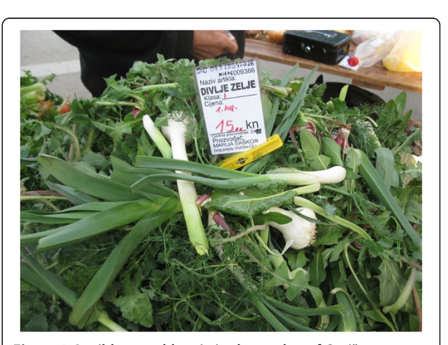
Figure 2 A wild vegetable mix in the market of Omiš.

Two group taxa involving several botanical species should be pointed out. One is žutenica/žućenica or radič/radić. This category encompasses a large number of Asteraceae (Cichorioideae) species. These are predominantly Crepis spp. (C. biennis, C. zacintha, C. sancta) but also other related genera (Taraxacum officinale Weber, Leontodon taraxacoides (Vill.) Mérat, Reichardia picroides (L.) Roth, Cichorium intybus L.). The respondents do not distinguish them well and usually cannot link the collected rosettes to the flowering forms. Some respondents even claimed that žutenica/radič have no flowers and when these plants flower they stop being žutenica/radić. Another collective name is kozja brada (literally goat's beard) applied to at least three