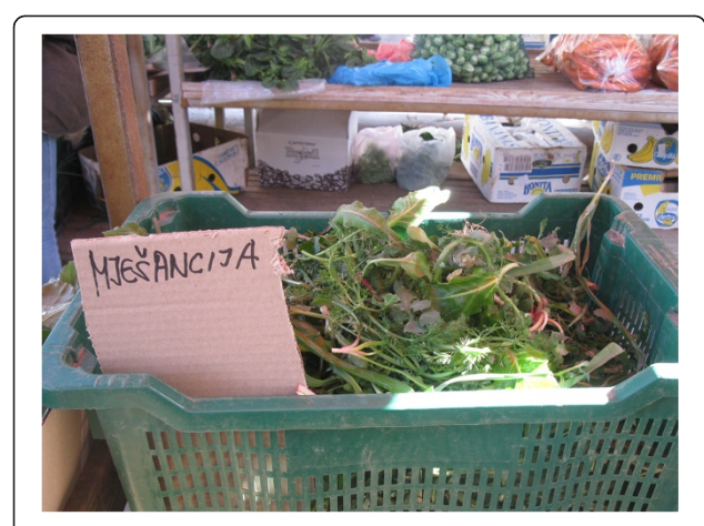
Figure 3 A wild vegetable mix in the market of Šibenik.

separate Asteraceae taxa ( Tragopogon spp., Scorzonera laciniata L. and Scorzonera villosa Scop).