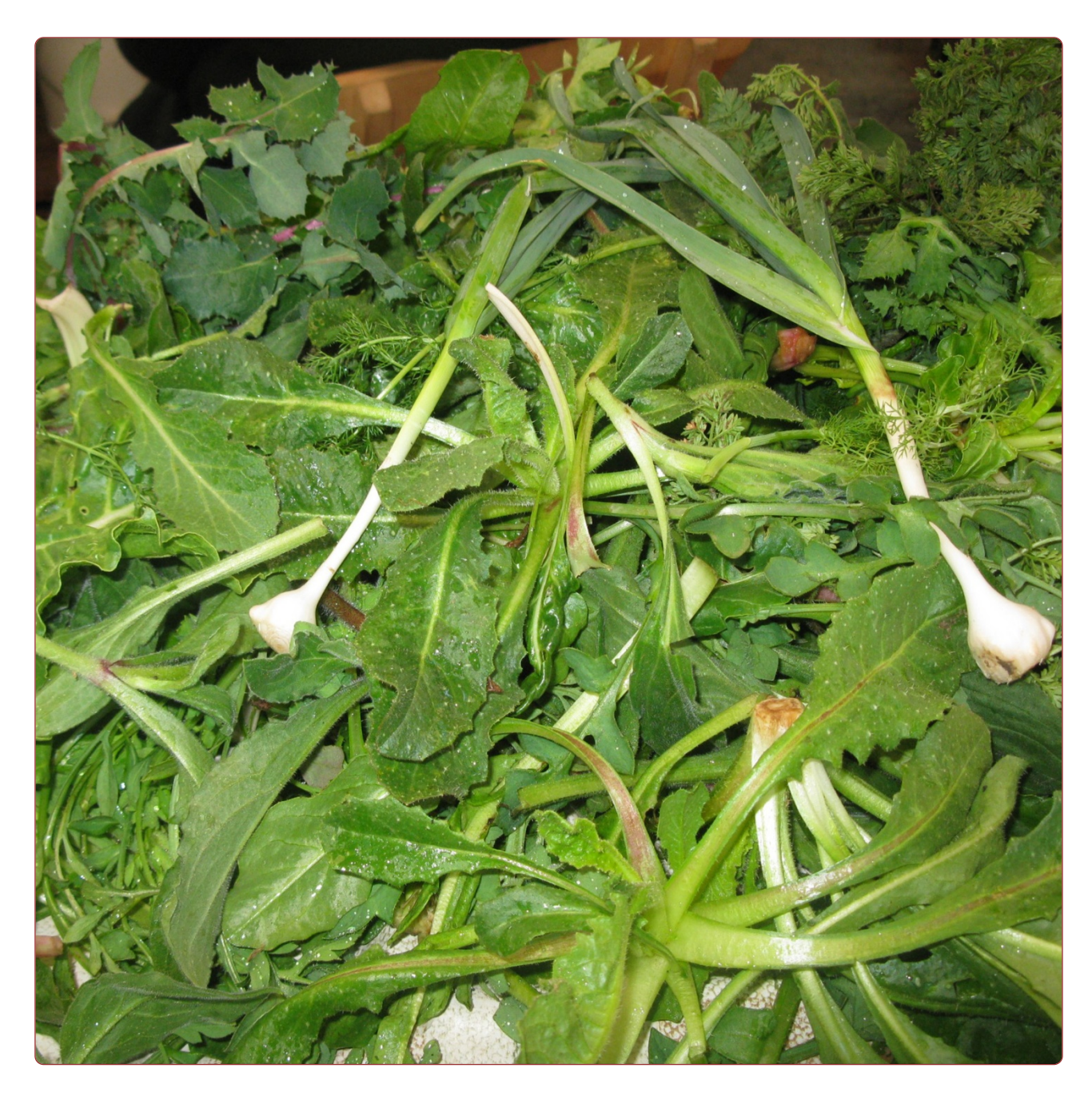
Wild vegetable mixes sold in the markets of Dalmatia (southern Croatia)