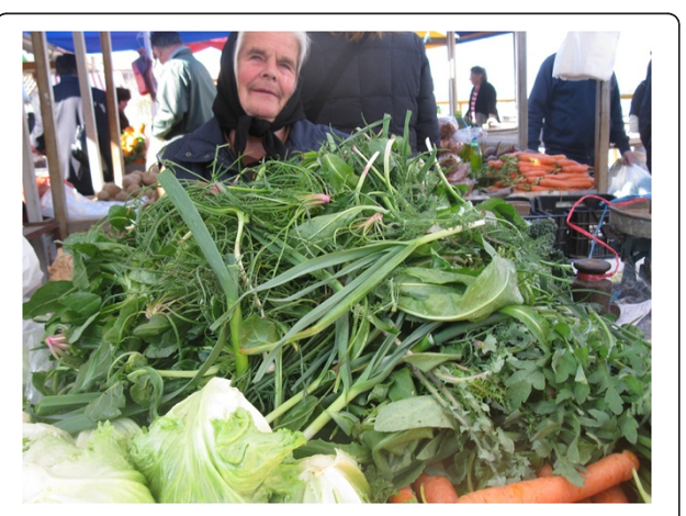
Figure 4 One of the oldest sellers of wild herbs in Dalmatia (Šibenik), aged 80, who has been selling the mix for over 60 years.

The sellers state that the tradition of eating wild herbs has been alive as long as their grandparents remember. Until the 1960s herbs constituted a substantial part of people's diet, but nowadays are used only occasionally, for example once a week as a side dish. They are boiled for 10–30 minutes, strained and seasoned heavily with olive oil and salt (e.g. 1 kg of wild herbs to 100–150 ml of olive oil). Sometimes also pršut (dried Croatian ham) is added. In the past (until the 1960s) the wild herbs were mixed with boiled potatoes, polenta or any other starchy products which were available. Another change