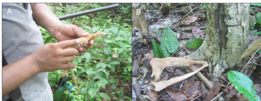
Fig. 6 The day after the Loojil Ts'oon is performed, the hunter must: (a) go to the forest to deposit, that is, give back the jaws [larger in (b)] so that the Lords of Animals give them new life, thus completing the cycle and renewing the hunting permission as established by the supernatural entities. Source: Photos by Dídac Santos-Fita; X-Pichil community, Quintana Roo (2011)

The fact that only the jaws of deer and peccaries are accounted for and given back to their Masters stands out. We are none the wiser as to why it is exclusively