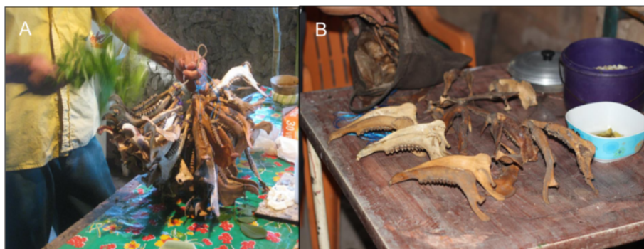
Fig. 5 As an important part of the Loojil Ts'oon : (a) the j-men, in his role as a ritual specialist, cleanses the prey's jaws (only deer: Odocoileus virginianus, Mazama spp.; and peccaries: Tayassuidae), (b) which the hunter has kept during the allowed hunting period in order to ritually remove the evil-wind ( mal aire in Spanish) they have accumulated in death and thus return them in a proper state to their owners and guardians in the forest. X-Pichil community, Quintana Roo (2011)