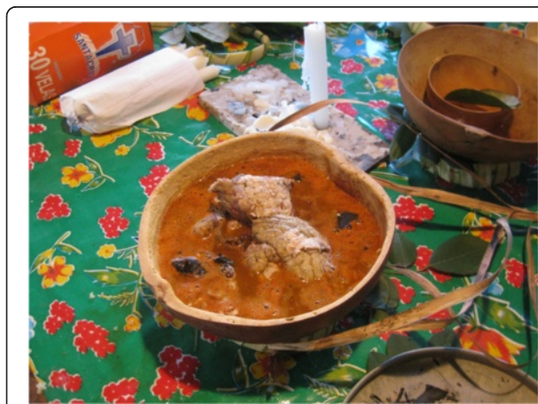
Fig. 4 “ Sip soup” ( jo'och Sip ): a special offering for the spirit/evil-wind called Sip , the main entity among the Lords of Animals. Source: photo by Dídac Santo-Fita; X-Pichil community, Quintana Roo (2011)

The j-men delivers the squash-pot with the cleansed soup to two helpers. They exit the house and take the right hand street. In almost complete darkness, they complete a walk on foot through the streets always taking left turns (counterclockwise), until they reappear on the opposite side of the street on which they started. During their walk the j-men 's helpers spill some “ Sip soup” on the ground and throw a twig from the sip che' bouquet, which was previously used for the cleansings,