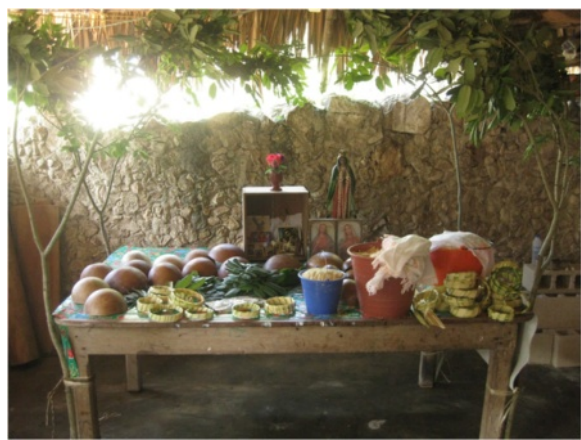
Fig. 2 Ceremonial deposit, where most of the acts of the Loojil Ts’oon ritual occur. X-Pichil community, Quintana Roo (2011)

In a large squash-pot (in the recorded event Lagenaria siceraria , Cucurbitaceae) with a ring and stripes made of reed so it can be suspended in the air, Don Manuel puts (in this order) the ingredients of the “ Sip soup” ( jo’och Sip ): i) an orange broth which is made of the foam previously obtained in the cauldron by parboiling and seasoning the game (deer and peccary) and rooster meats; ii) a special tortilla in pieces, called péenkuch , which is cooked buried in the ashes of the fireplace ( k’óoben ); iii) the cut up brains and parts of livers ( t’uup taman ) of the game and the rooster to be offered; and iv) 13 dried and ground sukure peppers ( Capsicum spp.; also called socorro in other communities of the region) (Fig. 4).