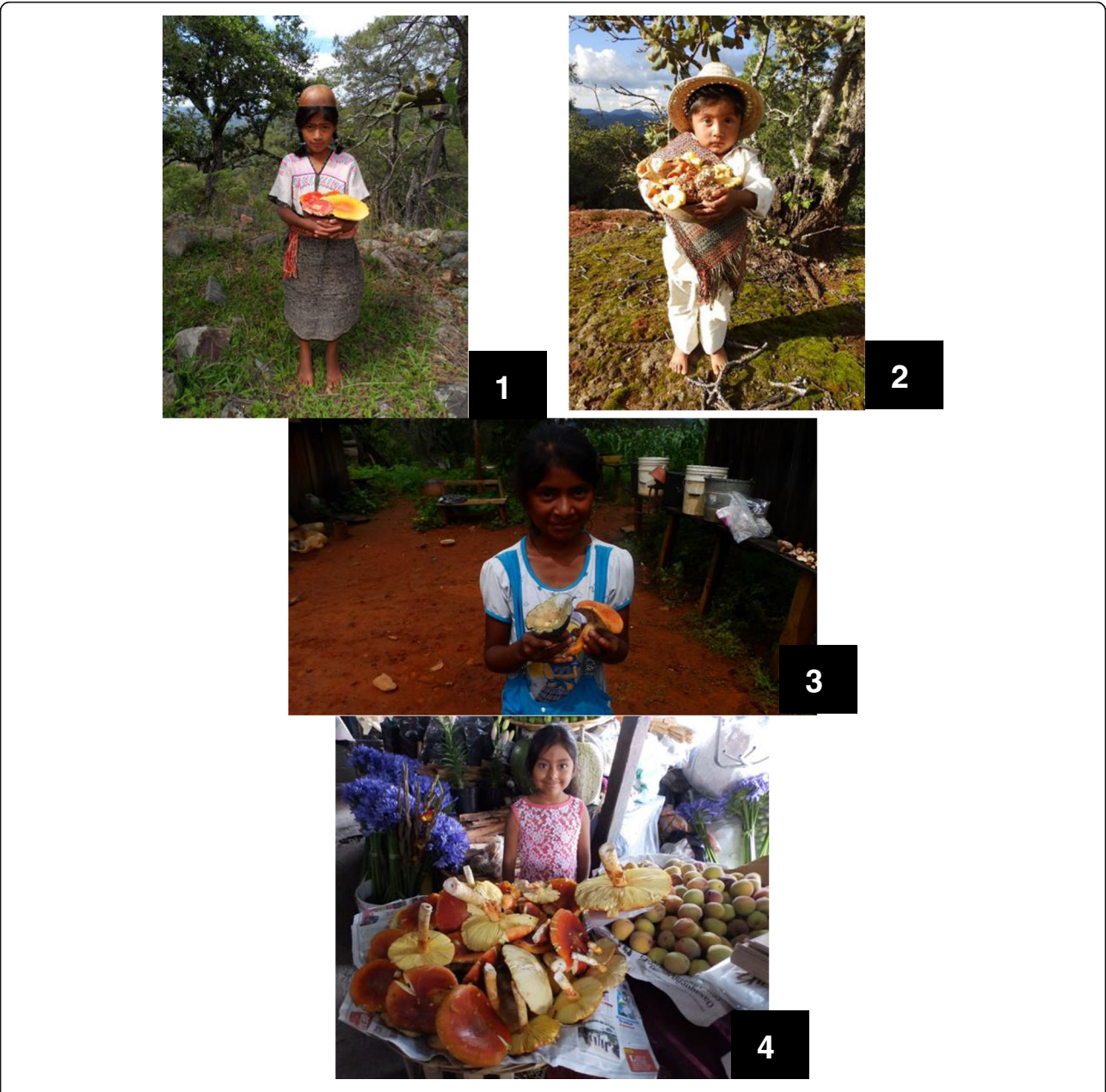
Fig. 4 Gathering of wild edible mushrooms by Mixtec children in "Mixteca Alta Oriental" of Oaxaca (1, 2, 3); collecting wild edible mushrooms by the population of the communities studied (4); marketing of A. aff. jacksonii in the market of the city of Oaxaca, Mexico (5)

to 2014, the accuracy of this belief was recorded. For the Mixtec peoples, rain ( savi or dau ) is the predominant meteorological phenomenon, and other phenomena are linked to it.