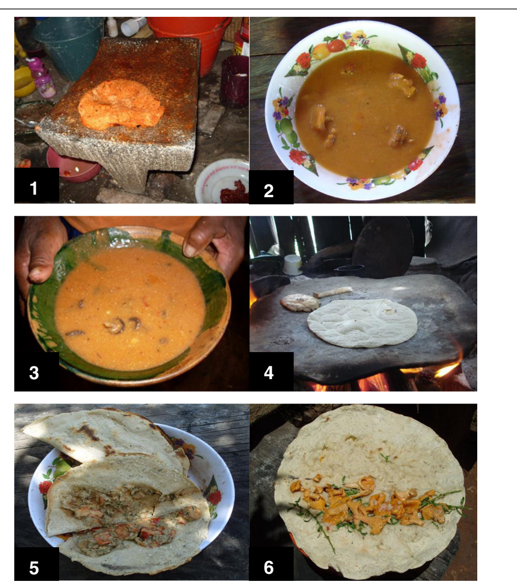
Fig. 5 Mixtec dishes whith mushrooms: 1 . Dough for mole "amarillito"; 2 . mole "amarillito" with Cantharellus cibarius s. l. ; 3 . mole "amarillito" with Marasmius oreades ; 4 . A . aff. jacksonii roasted on the "grill"; 5 . Empanada with Hypomyces lactifluorum ; 6 . Quesadilla of Cantharellus cibarius s. l

chindii, mushroom elf), which, because of their star shape, are collectibles (there is a challenge to find the most complete sporocarps and ones having different sizes). An advantage of this mushroom for ludic use is its durability. Also, informants reported that species of the genus Calvatia (xi'i ndivi kuni, mushroom egg turkey hen) or Pisolithus (xi'i ndivi burru, mushroom donkey testicle), when ripe, are used in children's games as projectiles ("snowballs") to throw at friends, siblings or grazing livestock. Undoubtedly, the natural curiosity of children represents potential and hope for the preservation and care of invaluable mycological resources for their ludic importance.