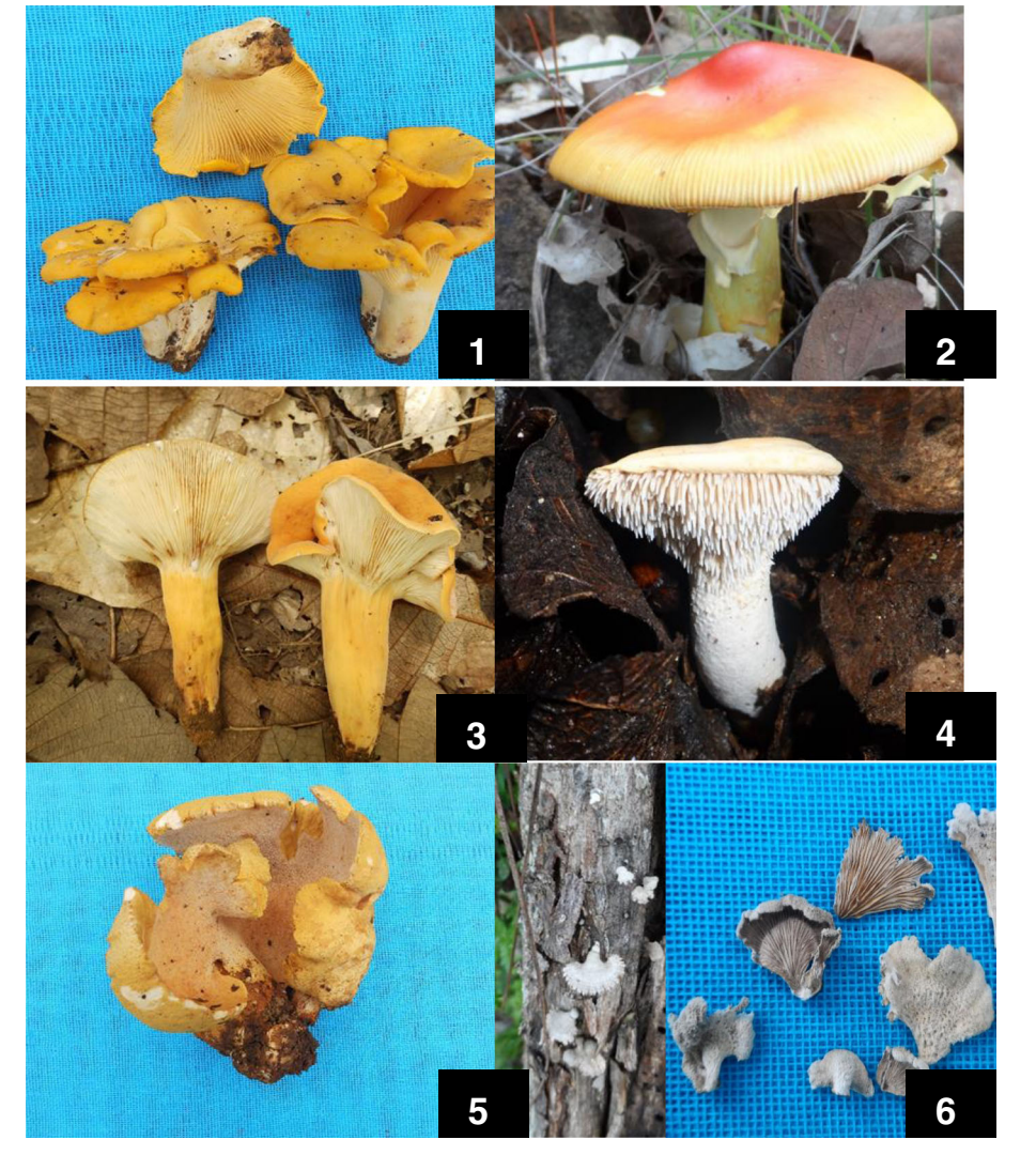
Fig. 3 Edible mushrooms in Santa Catarina Estetla and San Juan Yuta, state of Oaxaca, Mexico. 1. Cantharellus cibarius s. I.; 2. Amanita aff. jacksonii; 3. Lactarius volemus; 4. Hydnum repandum; 5. Albatrellus aff. ovinus; and 6. Schizophyllum commune

The nomenclature is based on the Index fungorum [36] and the ectomycorrhizal status in Rinaldi et al. [96] and Comandini et al. [97]. EL edible locally, L ludic, T toxic, DT deadly toxic, M mushroom, H humus, S soil, W wood debris, O other, G grassland, P Pinus forest (Mixed forests of Pinus oaxacana, P. lawsonii, P. michoacana, P. devoniana and P. pringlei), Q Quercus forest (Mixed forests of Quercus magnoliifolia, Q. castanea, Q. urbanii, Q. rugosa, Q. laurina and Q. acutifolia), P-Q forest of Pinus spp.-Quercus spp., TDF tropical deciduous forest, C crop, TG trophic group, EM ectomycorrhizal, MY mycoparasite, S saprobic. Mixtec community: 1: Santa Catarina Estetla; 2: San Juan Yuta; 3: San Miguel Tulancingo; 4: San Andrés Yutatio (numbers correspond to map in Fig. 1)