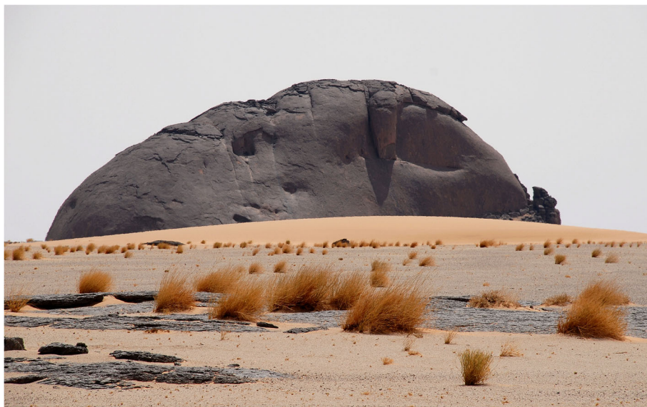
Fig. 3 A black granite hill in Tiris (GV)

Typing ‘ Nucularia perrinii ’ into Web of Science ( http://webofknowledge.com/UA ) returns just 1 hit, from our own previous work on Sahrawi pastoralism [28], whereas typing ‘ Nucularia perrini ’ (the form in which the scientific name is often misspelled) results in 2 hits, related to research on desert locusts [29, 30]. In Google Scholar ( https://scholar.google.com/ ), the figures are of 24 and 63 hits, respectively. Besides reports of its endemic condition in western and central Sahara,