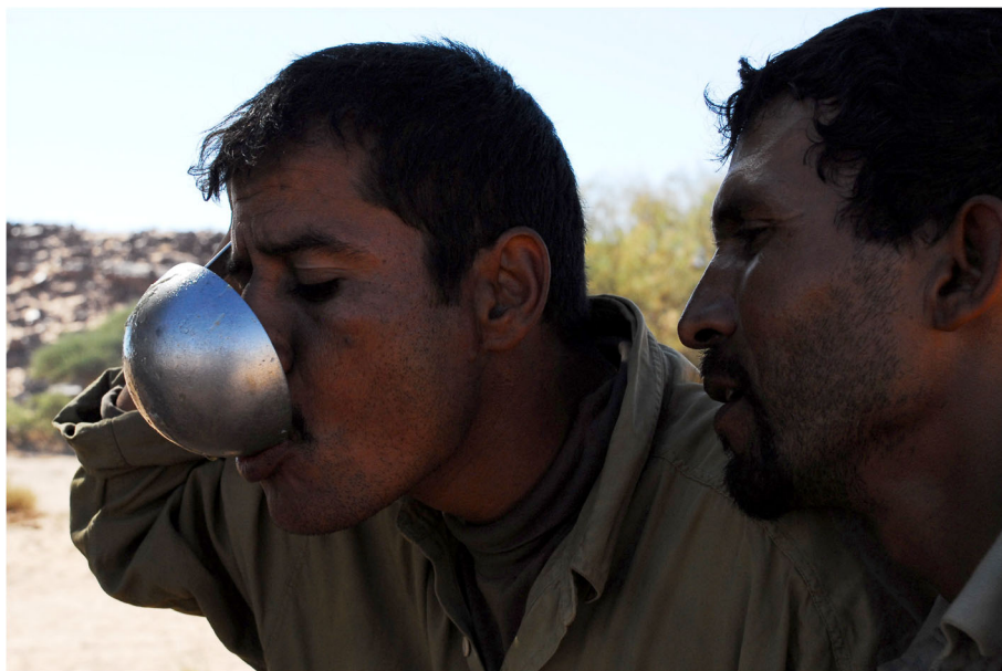
Fig. 8 Refugees drinking camel milk (GV)

The Sahrawi construe a further contraposition in terms of differences between the refugee camps and the customary grazing territories of Western Sahara, in