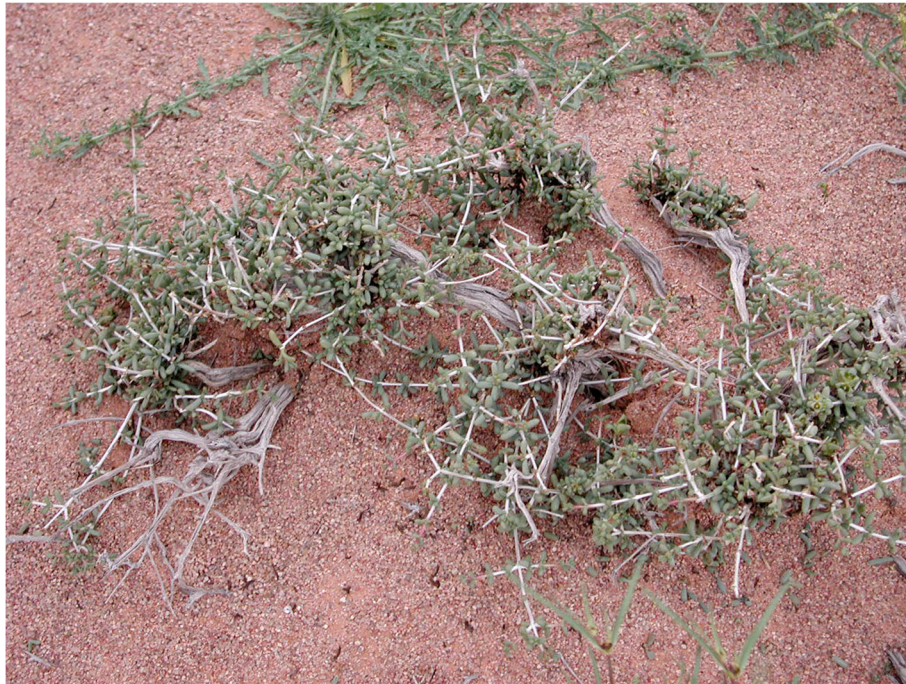
Fig. 4 Plant of N. perrinii (GV)