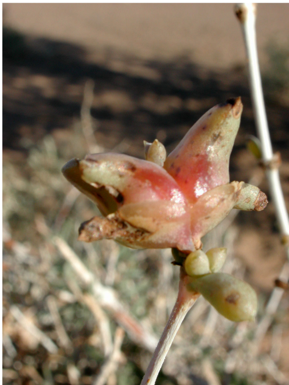
Fig. 5 Fruit of N. perrinii (GV)