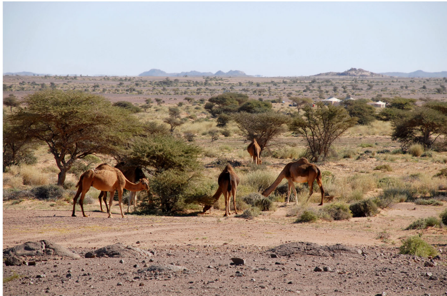
Fig. 2 The Acacia-Panicum vegetation of Zemmur (GV)

western Sahara 1 , a central role and position is given to an endemic halophyte plant, N. perrinii or askaf , as it is locally called.