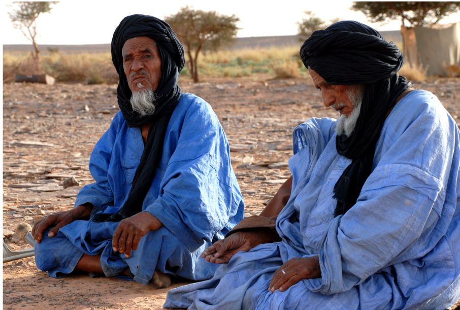
Fig. 9 Old refugees in the former nomadic territories (GV)

terms of presence/absence of askaf , constraints in camel husbandry, and taste of camel milk. These contrapositions are embedded into a narrative that symbolically represents refugee camps as places where traditional livelihoods can't be pursued, where camels do not live and produce at their best, where camel products do not have the 'right taste,' and where the food obtained through aids (e.g. powder milk) do not adhere to Sahrawi gastronomic standards.