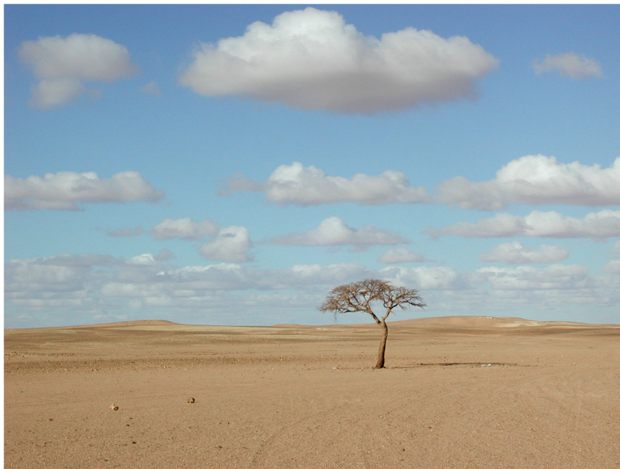
Fig. 1 A solitary Acacia tree in the barren landscape of the Hammada of Tindouf (GV)