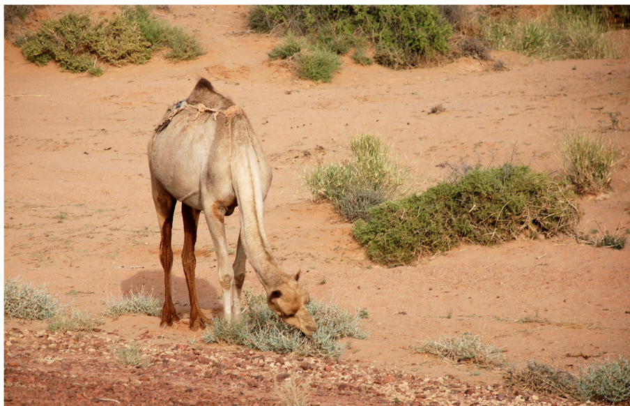
Fig. 7 Camel grazing askaf (GV)

Camels graze often and preferentially on salty species, especially on plants with fleshy leaves that are high in protein and low in fiber content, and which develop green aerial parts during wet and dry periods alike [60, 61]. Due to camels’ need of six to eight times as much salt as other herbivores, halophytic plants represent the primary constituent of their diet, contributing up to one third of the total diet, with an even larger share during dry seasons and spells [32, 60]. Western Saharan camels get much of their salts from N. perrinii , which plays a fundamental role in camel diets, especially in the cold season, i.e. before annuals have sprouted [10, 62, 63]. During this period, nomads may lead their herds to a ‘salt cure’ based on N. perrinii , a 45-days diet that ‘cleans camels’ blood’ due to