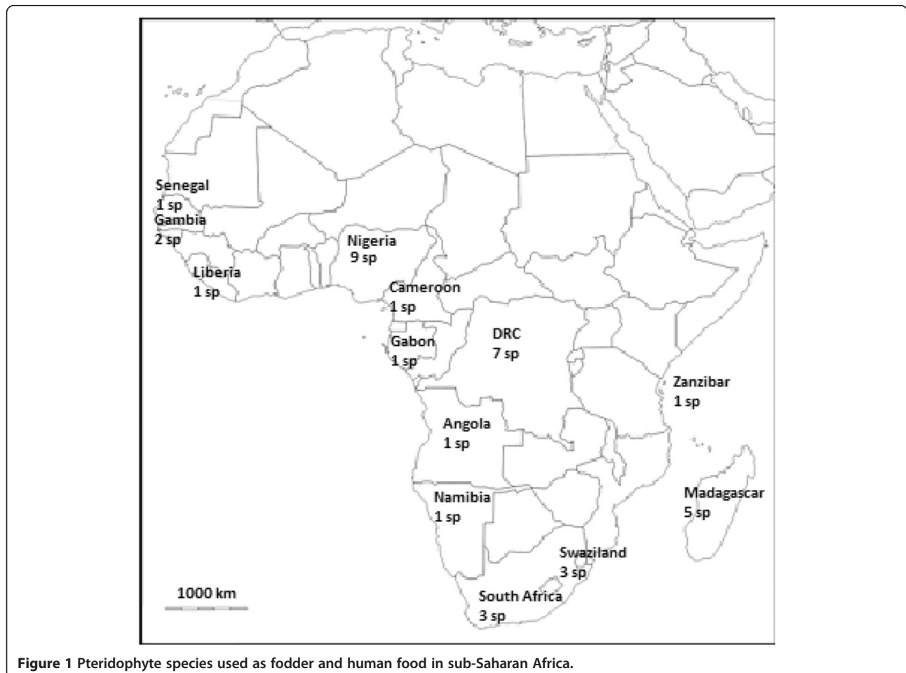
Figure 1 Pteridophyte species used as fodder and human food in sub-Saharan Africa.

raw or as salad, edible rhizomes and leaves fed to livestock (12.5% each), herbal tea and famine food (4.2% each) (Figure 3). When a rhizome is eaten, leaf bases are removed, cleaned and peeled. Pteridophytes consumed as leafy vegetables or potherbs or salads, are usually collected at vegetative stage, when leaves are young and tender. These findings correlates with observations made by Lognay et al. [17] that bundles of freshly uncurled fronds