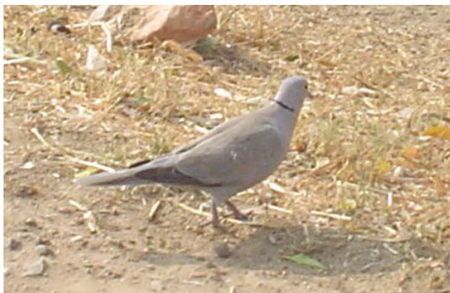
Figure 2 Collared dove.

Noteworthy is the observation that mostly animal byproducts are used in traditional health care systems without any loss to animal. The therapeutic information's is mostly based on domestic animals, but some protected