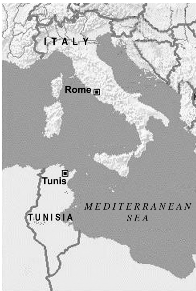
Figure 1 Map of investigated area

In Tunisia, the typical Mediterranean climate which prevails in the Northern and Eastern part of the country collides with the desertic one in the South. In Italy, the climate is generally temperate; although, from North to South, three distinct climatic belts are distinguishable. People living in rural areas have been engaged in agriculture. In the Tunisian villages far from the towns, popular or traditional use of medicinal plants is still familiar to ordinary people. Whilst in Italy, it survives mainly amidst shepherds and older farmers.