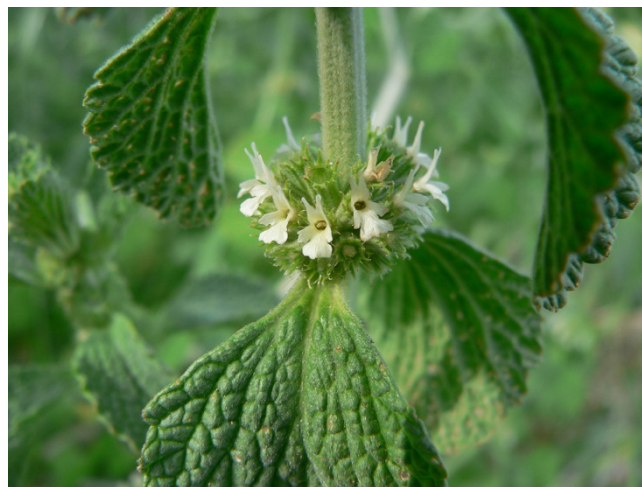
Figure 3 Marrubium vulgare L., one of the most used species in both countries

The Resolution of the World Health Organization issued in 1990 states that " The use done for a long period of time