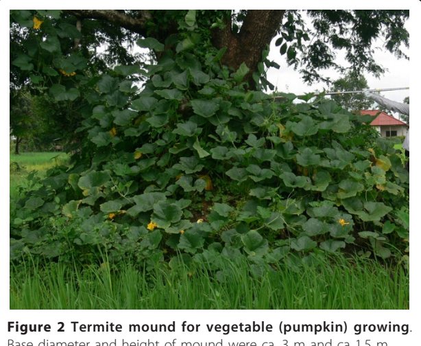
Base diameter and height of mound were ca. 3 m and ca 1.5 m, respectively. Termite species was unknown.

respondents also used the termites as fishing bait and chicken feed. No other forms of mound soil utilization were found.