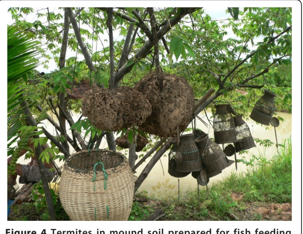
Figure 4 Termites in mound soil prepared for fish feeding. Termite species was unknown.