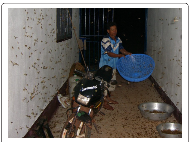
Figure 5 Catching emerged termites for eating. Termite species was unknown.

The volume of 53 mounds, including mounds that had been cut, was measured individually 3 times from March to November (Table 3). The average volume increase was -0.077 m<sup>3</sup> from March to July and 0.002 m<sup>3</sup> from July to November. The negative growth in the former period may have been caused by the cutting out of