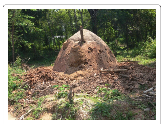
Figure 3 Termite mound for charcoal kiln. Base diameter and height of kiln were 2.4 m and 1.8 m, respectively. Termite species was unknown.