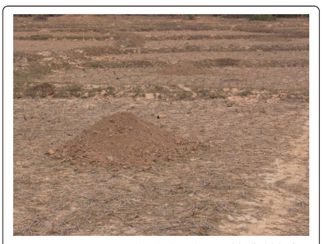
Figure 1 Termite mound soil placed in paddy field before plowing. Width of soil mound was ca. 80 cm. Termite species was unknown.

It was usually observed in the early rainy season that villagers catch emerged termites (alate) and eat them after broiling (Figure 5). Wherever the alate first land, they immediately lose their wings. Villagers use water basins to catch the termites and prevent them from escaping. They also collect termite mushrooms ( Termitomyces sp./spp.) for eating and for sale on markets. The mushrooms are the most prized wild mushrooms in the Vientiane Plain due to their flavor [19]. Various kinds of natural resources are used by the villagers, most of which are sold on markets to earn cash [20].