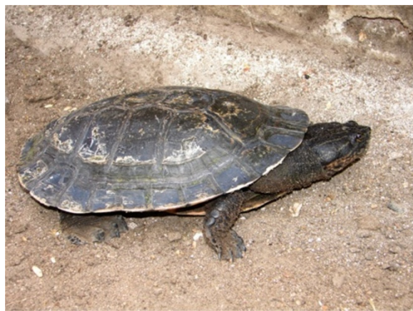
Figure 17 Phrynops tuberosus (Peters, 1870).

Comments: Kinosternon scorpioides is a small-sized chelonian that may reach 18 to 27 cm of rectilinear length of the carapace [46,93]. The colour of the carapace can vary from light to dark brown, and the plastron and the lower marginal plaques are yellowish, although they may also have dark brown spots. Its head and neck and the dorsal portions of the back and womb are dark, the head can be sprinkled with light dots, and the jaws