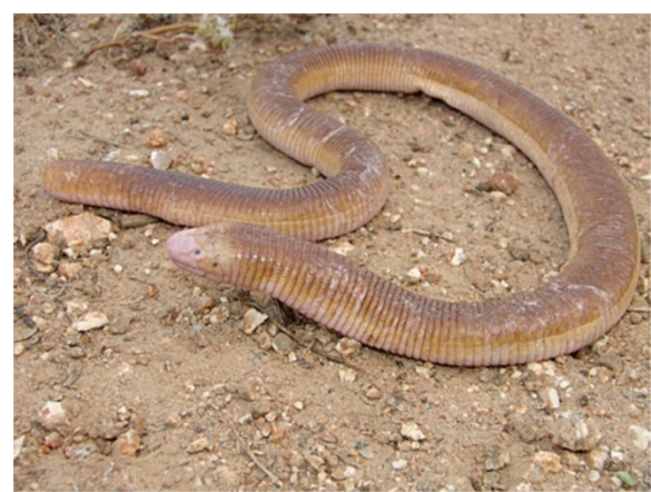
Figure 13 Amphisbaena alba (Linnaeus, 1758) (Photo - Washington Vieira).