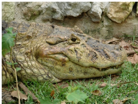
Figure 38 Caiman latirostris (Daudin, 1802).

Comments: The spectacled caiman is a medium-sized crocodylian; and the adult specimens may reach a total length of 1.5 to 2.1 m, but they rarely exceed 2.4 m in length. It has a lighter colour than other species of caimans and varies from olive drab with black cross-stripes in adults to yellowish to olive with spots on the flanks and the tail in younger organisms. Occasionally, there is no spot on its jaw [71,122]. It has an infra-orbital crest, and two to four series of small, post-occipital and nuchal shields that are dispersed into four transversal series, where 2 or 3 are formed by four shields [122,124]. Its back has from 8 to 10 shields in the larger-sized, transversal series and ventral shields in the 20 to 24 transversal series [122,124]. It is found to be geographically wide spread in the neotropical region [125,126]. Its occurrence in the semi-arid region of northeastern Brazil has been reported by Borges-Nojosa and Cascon [127] to be in the Serra das Almas Reserve, Ibiapaba city, and in the locality known as Cabaças, which is situated between Ibiapaba and Crateús, Ceará state. The occurrence of this species in these two areas indicates that crocodylians