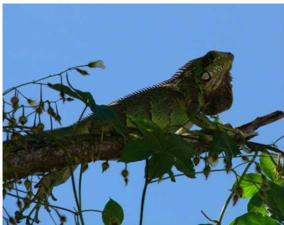
Figure 6 Iguana iguana (Linnaeus, 1758).