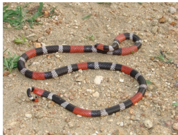
Figure 25 Micrurus ibiboboca (Merrem, 1820).

treating asthma, snake bites, thrombosis, wounds, luxation, rheumatism, pain in the legs, erysipelas, deafness, epilepsy, skin diseases, tuberculosis, hanseniasis, backache, tumours, boils, headaches, earaches, osteoporosis, sore throat, toothaches, for pain relief from injuries caused by insect stings, and for irritation when milk teeth are erupting [33]. The rattle and skin of these organisms are used for magical/religious purposes [17].