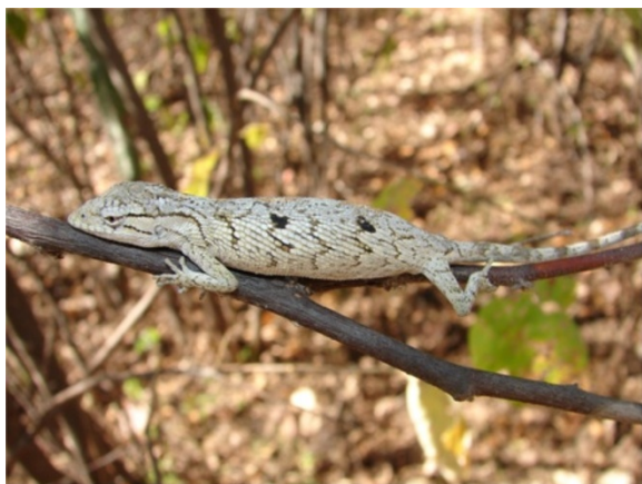
Figure 7 Polychrus acutirostris (Spix, 1825).

Comments: Polychrus acutirostris a small-sized animal that can reach 14 to 25 cm in cloacal rostrum length. Its back and flanks vary in colour from light to dark grey, light to dark brown, or olive-grey to grey or grey-brown. However, some specimens may be greyish-white with darker spots [46,58,71]. Black lines begin at