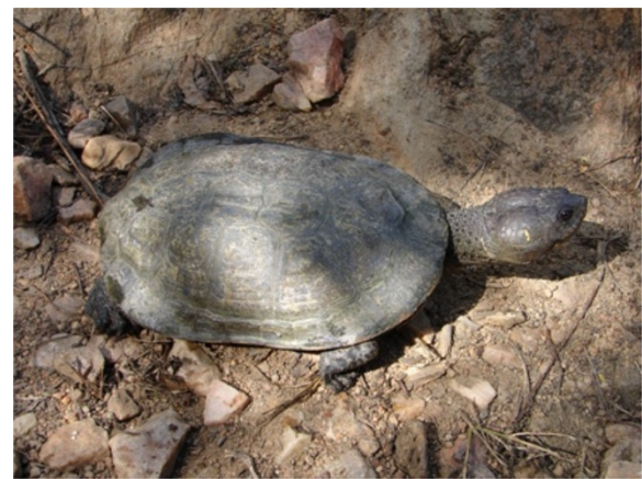
Figure 16 Mesoclemmys tuberculata (Lüderwaldt, 1926).

Comments: Mesoclemmys tuberculata is a medium-sized species that may reach 25 to 30 cm in rectilinear