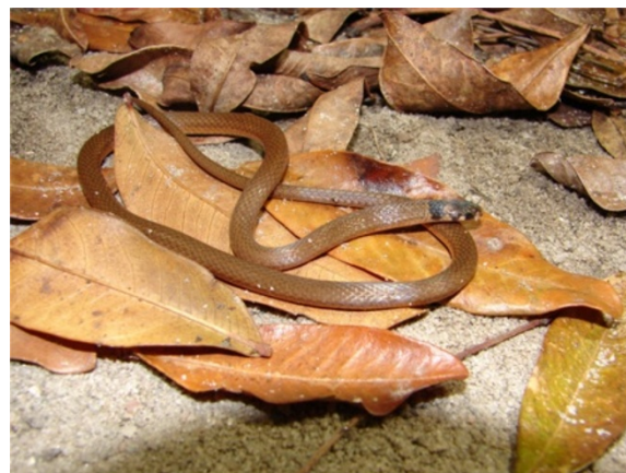
Figure 30 Tantilla melanocephala (Linnaeus, 1758).

Comments: A medium to large species with geographic distribution restricted to Caatinga biome [116]. There is no information about natural history of Boiruna sertaneja , although considering the habits of other species of the genus, B. sertaneja must have terrestrial habits, nocturnal activity and the diet must be based on snakes and lizards [109]. This species present ontogenetic color change with the juveniles exhibiting coral color in the dorsum and the adults are completely black. Boiruna sertaneja is easily distinguished of other black snake of the region Pseudoboa nigra . One of the main differences of P. nigra and B. sertaneja can be observed in subcaudal scales – the subcaudal scales of P. nigra are single while the ones of B. sertaneja are divided.