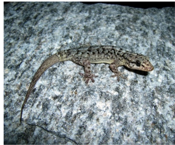
Figure 10 Phyllopezus pollicaris (Spix, 1825).

Comments: Phyllopezus pollicaris is a small-sized animal that may reach 6 to 9 cm in cloacal rostrum length. Its back colour varies from light to dark grey and has randomly spread black dots. Additionally, transverse dark stripes are occasionally interrupted by a light, medium-dorsal line. Certain adult specimens may be a darker colour, and in these cases, the transverse stripes and the medium-dorsal line are less pronounced. On the