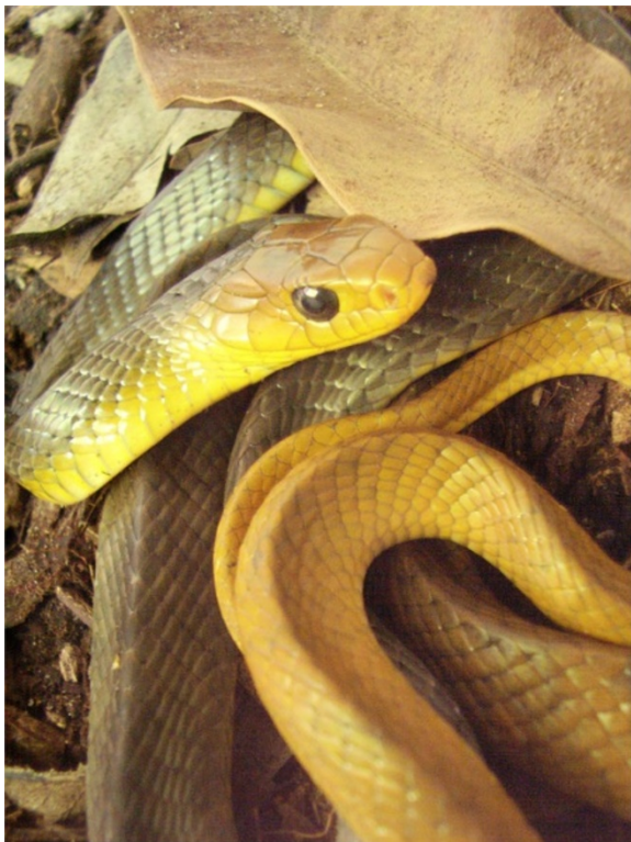
Figure 26 Drymarchon corais (Boie, 1827) (Photo - Sanjay Veiga).

Comments: A small to medium sized snake, distributed in forest and open environments (Caatinga, Atlantic Forest and Amazon) [114]. This species is diurnal and arboreal, the diet is based primarily on amphibians but