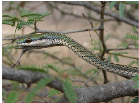
Figure 27 Leptophis ahaetulla (Linnaeus, 1758).

lizards and small birds are also consumed. Leptophis ahaetulla presents a very characteristic defensive display performing false strikes and opening the mouth showing a black mucosa that covers its interior [109].