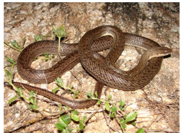
Figure 34 Philodryas nattereri Steindachner, 1870 (Figure 33).