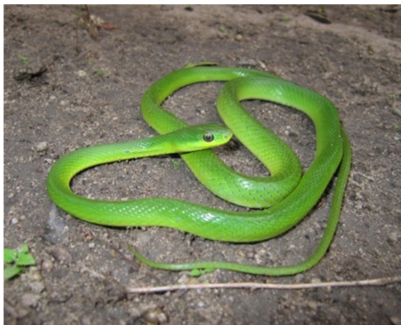
Figure 35 Philodryas olfersii (Linchtestein, 1823).

Comments: A medium sized snake with distribution in open vegetal formations such as Caatinga and Pantanal [109,118]. This species is diurnal and terrestrial; the diet is based primarily on toads. This species present a very characteristic defensive display consisting on flattening