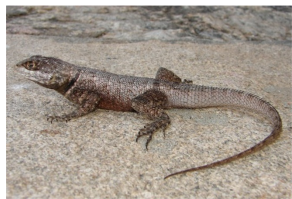
Figure 11 Tropidurus hispidus (Spix, 1825)(Photo - Washington Vieira).