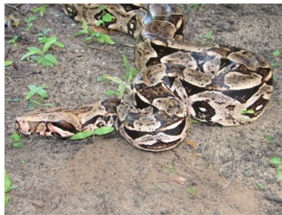
Figure 20 Boa constrictor (Linnaeus, 1758).

Ethnozoological notes: Records of the use of this species as food exist in some locations in the northeastern semi-arid region of Brazil; through interviews with hunters, the consumption of the meat of this species was recorded in Pocinhos city (Paraíba State). The consumption of B. constrictor in the city of Pedra Branca, which is located in the state of Bahia, was also reported by