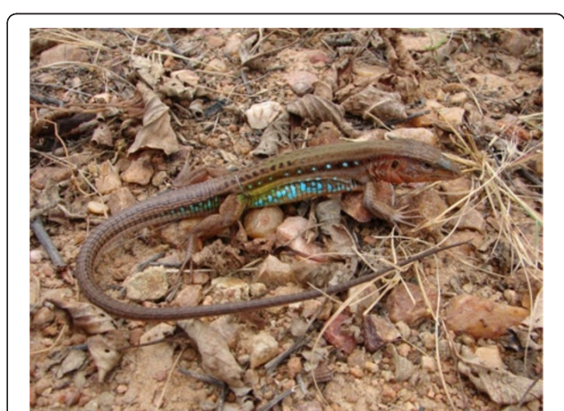
Figure 5 Cnemidophorus ocellifer (Spix, 1825) (Photo - Washington Vieira).

Ethnozoological notes: This species represents the second most important species of lizards from the Caatinga; however, unlike T. merianae , it is not hunted much. The meat of this organism has been used as a source of protein, and other products, such as the fat and bones, have been used in local medicine [11]. I. Iguana is also ordinarily used as a pet throughout Brazil [3]. The consumption and commercialisation of I. iguana meat is common in the tropical Americas [79,80], and its meat and eggs are the principal protein sources of many diets. In Brazil, the consumption of chameleon “camaleões”