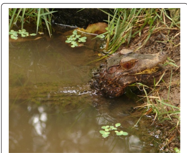
Figure 40 Paleosuchus palpebrosus (Cuvier, 1807).

Comments: The dwarf Caiman is the smallest species of crocodylian that is found in the neotropical region. Males may reach 1.5 m and females may reach 1.2 m in length [71,123]. The adults are usually dark-brown with large, blackish stripes that spread onto the top portion of the tail. The younglings are yellowish and have dark stripes on their backs. The tail and belly are whitish, and its iris is dark-brown [71,123]. The infra-orbital crest is absent, and there are two series of post-occipital shields; the first one of the two groups has three large shields. The nuchals generally touch each other and are dispersed into four or five transversal series, with two being formed by three or four shields [122,124]. The striking feature in this species is the presence of a crest crown on the posterior region of the head, which is high, short