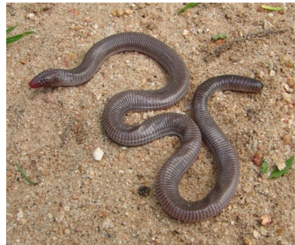
Figure 15 Amphisbaena vermicularis (Wagler, 1824).

autotomy in the fifth and seventh segment. A. vermicularis has four pre-cloacal pores, no paws, a rounded muzzle, and primitive eyes that are covered by a scale [46,88]. This species is widely spread in the northeastern region of Brazil and has been recorded in the Pará, Minas Gerais and Mato Grosso states [46,88].