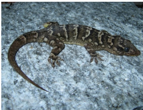
Figure 9 Phyllopezus periosus (Rodrigues, 1986).

side of the organism, there is a dark stripe that spans from the orbit, passes through the tympanum and slightly beyond the shoulder, and reaches the lateral edge of the first three transverse stripes of the back [46,84]. The bellies of adult and young specimens are white, and the head is flat and large and in the dorsal-ventral position. The eyes are large, without eyelids and with elliptical pupils. The back has small granules that are smooth and juxtaposed and are interspersed with larger distal tubercles, which are conical and sparse. The digits of the hands and feet possess a row of whole and smooth lamellae, and in the hands and feet, the distal lamellae are generally imbricate [46,82,84]. The species is found to be widely spread in open spaces of South America, especially in Caatinga, Cerrado and in other Brazilian seasonal dry tropical forests, the Paraguayan chaco, southern Bolivia and northern Argentina [83].