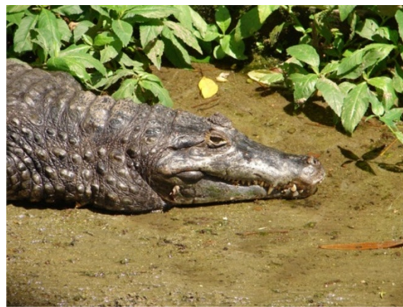
Figure 39 Caiman crocodilus (Linnaeus, 1758).