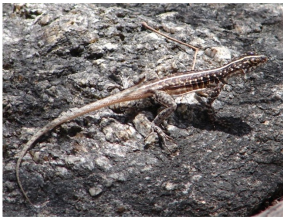
Figure 12 Tropidurus semitaeniatus (Spix, 1825).

Comments: Amphisbaena alba is a medium-sized animal that may reach 70 to 75 cm in cloacal rostrum length. The adults' colour varies from yellowish to light brown, and it has a whitish belly [87]. This organism has an elongated and cylindrical body, ring-shaped scales, and a short and round tail, which resembles a head. The body has 4 to 10 pre-cloacal pores, and paws are absent. The muzzle is rounded, and the eyes are rudimentary and covered by a scale [71,72,87,88]. This species is widely spread throughout the central eastern area of South America, which contains a variety of phytogeographic features [71,72,87,88].