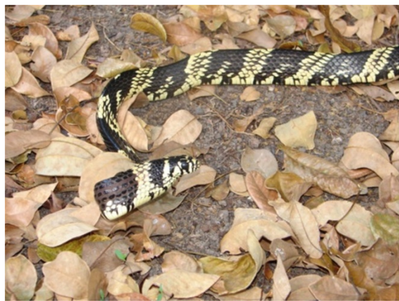
Figure 29 Spilotes pullatus (Linnaeus, 1758).

Boiruna sertaneja Zaher, 1996 (Figure 31) - Common name: Black snake, “cobra preta”.