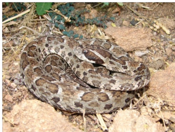
Figure 24 Bothropoides erythromelas (Amaral, 1923) (Photo - Washington Vieira).

Ethnozoological notes: This species is one of the most feared by the inhabitants of the semi-arid region of Brazil. Because of its potential for lethality, it represents a risk for people and domestic animals, which is why members of this species are normally killed when they are found. However, products of this species are used for different purposes. Although it is not typical, in some localities, the meat of the species is consumed as food. Marques and Guerreiro [65] have reported that snake meat snacks were being sold for approximately US$1.50 in the public marketplaces of Feira de Santana, Bahia. The fat of a rattlesnake is used in popular medicine for