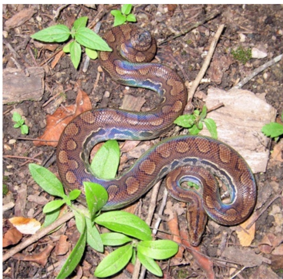
Figure 21 Epicrates assisi (Machado, 1945).

Comments: This is a medium sized species with a restricted distribution to Caatinga domain [108]. This species is similar to Boa constrictor in many ecological aspects.