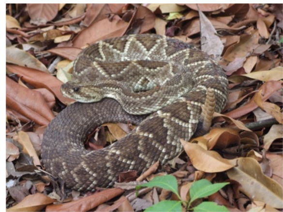
Figure 23 Crotalus durissus Linnaeus, 1758.

Comments: Medium sized snake with a wide distribution in Brazil. There are records in Pantanal, Amazônia, Atlantic Forest and Caatinga [109-112]. Rodrigues [112] presents the first record of C. hortulanus in Caatinga region specifically to Sao Francisco River sand dunes.