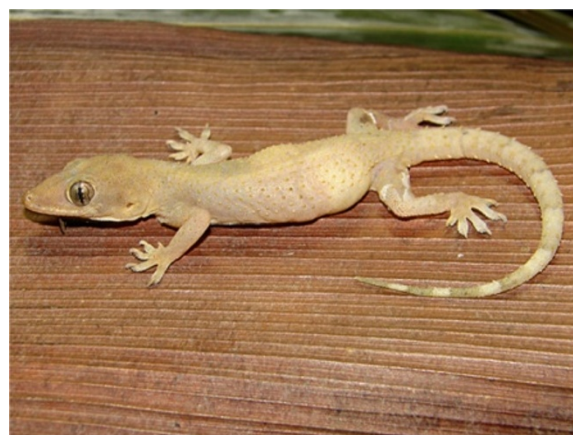
Figure 8 Hemidactylus mabouia (Moreau de Jonnés, 1818).

Comments: Hemidactylus mabouia is a small-sized animal that may reach 6 to 10 cm in cloacal rostrum length. The colour of its back is variable and ranges from light grey to dark grey or from light brown to dark brown and can sometimes be nearly white. Additionally, it has many dark spots, which can be irregular-shaped or round, and four to six transverse stripes spread along its back [46,58,71,72]. The womb is whitish and may have small dots. The head is flat and large and in the dorsal-ventral position; the eyes are large and have elliptical pupils; and its back has small granules that are interspersed with tubercles that are conical and fairing. The hands and feet of this animal have a double row of lamellae, which are transversally extended. The species is found in Africa and was introduced in America. It has now spread to Central America, the Caribbean, South America and Florida, USA [46,58,71,72]. In Brazil, the first records of H. mabouia in natural habitats occurred in 1945 [81].