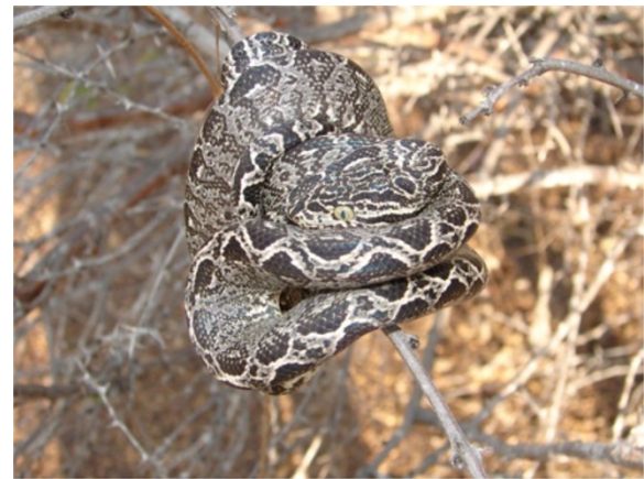
Figure 22 Corallus hortulanus (Linnaeus, 1758).

The diet is also based on small mammals; it is a nocturnal species with primarily terrestrial habitats. Epicrates assisi presents labial pits and the dorsal ground color presents iridescent pigments. The iridescence distinguishes this species for all others in Caatinga domain.