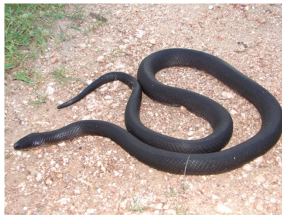
Figure 31 Boiruna sertaneja Zaher, 1996 (Photo - Washington Vieira).

Ethnozoological notes: The majority of the time, this species is killed for being thought to be a poisonous animal. However, in some locations, this species is not killed once hunters realise that it is not poisonous and