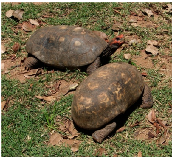
Figure 19 Chelonoidis carbonaria (Spix, 1824) (Photo - Washington Vieira).

Comments: Chelonoidis carbonaria is a medium-sized species that may reach 30 to 70 cm of rectilinear length of the carapace. Its colour may vary from very dark brown to black, the centre-most area of the scute (areola) is yellow or orange, the plastron varies from yellow to orange, and each scute is outlined along the growth lines by dark pigments. The head of this organism is dark, and it has scales that vary from red to yellow. The back and ventral portions of the neck are completely dark grey. The legs are columnar-shaped, and the anterior portions of the limbs present red or orange scales [92,94]. This chelonian is found in southern Panama, in the western Andes in Colombia Chaco, Venezuela, from Guyana to eastern Brazil, in southern Rio de Janeiro, from western to eastern Bolivia, in Paraguay, and in northern Argentina. It seems