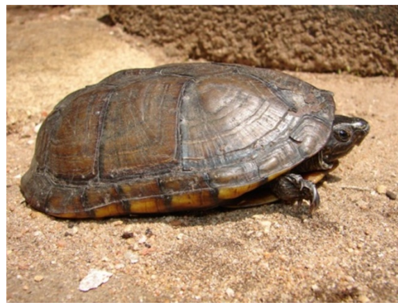
Figure 18 Kinosternon scorpioides (Linnaeus, 1766).