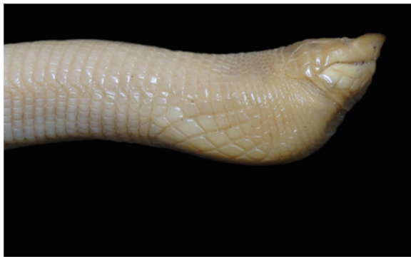
Figure 14 Amphisbaena polystega (Duméril, 1851).

Comments: Amphisbaena vermicularis is a small-sized animal that may reach 32 to 35 cm in cloacal rostrum length. The adults' colour varies from greyish to light brown, and it has a whitish belly [46]. This organism has an elongated and cylindrical body, ring-shaped scales, a short tail that is rounded on the end, and a level of