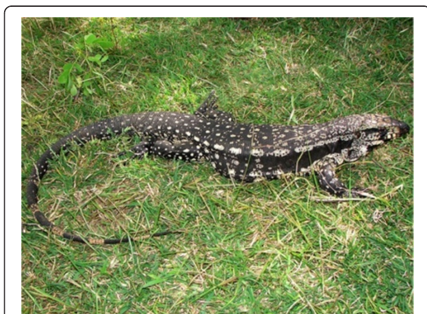
Figure 3 Tupinambis merianae (Duméril & Bibron, 1839) - (Photo - Washington Vieira).