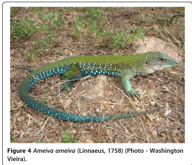
Figure 4 Ameiva ameiva (Linnaeus, 1758) (Photo - Washington Vieira).

short head, round and short muzzle, large and oval tympanum, a large and round scale that is located on the tympanum, a large and appendix or gular crest, and a medial row of triangular scales that are laterally compressed [46]. This species is found in a widely spread area that includes México, Central America, areas of the Antilles, Brazil and Paraguay [46,58,71,72].