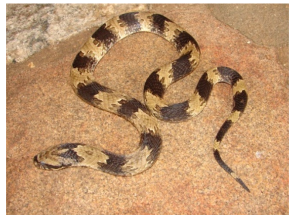
Figure 37 Xenodon merremii (Wagler, 1824).

the region of the neck and open the mouth exhibiting the interior black mucosa. This species often confused with the Caatinga Lance Head Bothropoides erythromelas due to the color of the dorsum, although they are