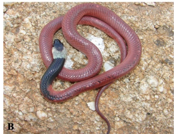
Figure 36 Pseudoboa nigra (Dumeril, Bibron & Dumeril, 1854). Adult (above) and juvenile (below).

the region of the neck and open the mouth exhibiting the interior black mucosa. This species often confused with the Caatinga Lance Head Bothropoides erythromelas due to the color of the dorsum, although they are