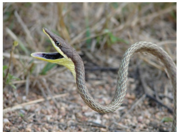
Figure 28 Oxybelis aeneus (Wagler, 1824) (Photo - Washington Vieira).

Comments: A small to medium sized snake with a large geographic distribution [115]. This species can be found from south Arizona in North America, throughout Central America and most part of South America. In Brazil it inhabits all biomes occurring in open and forest environments. In Caatinga this snakes occurs in all environments. This species is arboreal and diurnal feeding primarily on lizards, but small frogs can also be consumed [109]. The preys are killed by envenomation.