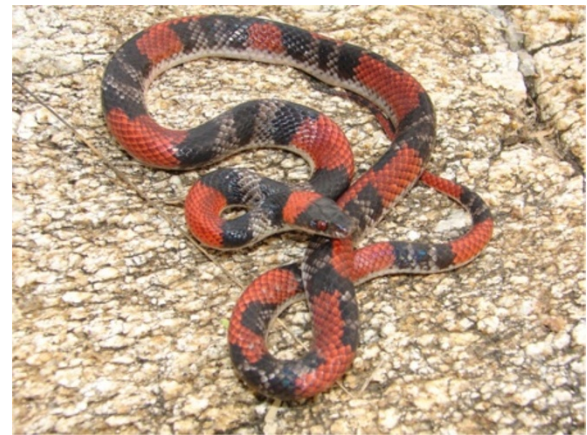
Figure 33 Oxyrhopus trigeminus Dumeril, Bibron & Dumeril, 1854 (Photo - Washington Vieira).

Oxyrhopus trigeminus Dumeril, Bibron & Dumeril, 1854 (Figure 33) - Common name: “falsa coral”, “tricolor”.