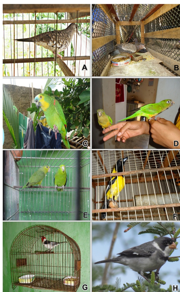
Figure 3 Examples of species kept in captivity in city of Santana dos Garrotes (Paraíba State, Northeast Brazil).

A - Columbina squammata ; B - Patagioenas picazuro ; C - Amazona aestiva ; D - Aratinga cactorum ; E - Forpus xanthopterygius ; F - Icterus jamacaii ; H - Paroaria dominicana , and D - Sporophila albogularis .