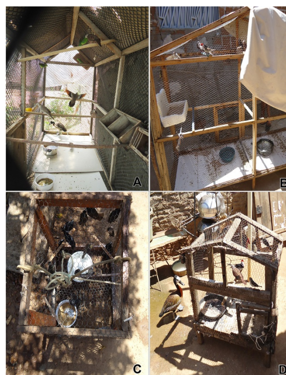
Figure 4 Aviaries in which wild birds are kept in our study area.

Among the interviewees, 75.6% ( n = 59 ) stated that the birds maintained in captivity were exposed to various diseases, and 24.4% ( n = 19 ) said that they did not know