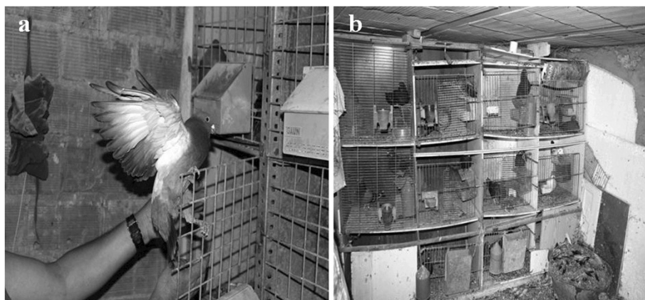
Figure 1 Pigeons bred in captivity: a) Pigeon. b) Traditional dovecotes.

The latitude of the Valencian territory lies between 37° 51' and 40° 47' North. The geophysical environment is diverse, there are plains, valleys, plateaus, etc., and differences in altitude that range from sea level to 1800m.