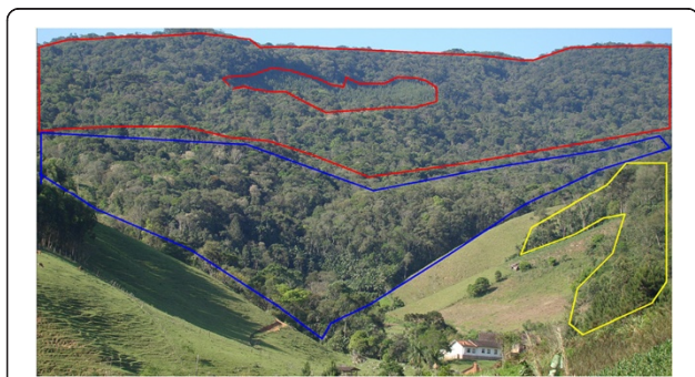
Figure 2 Units of landscape recognized for community of Ribeirão Taquaras. Red: “urwald”, blue: “aldacapavera”, yellow: “capavera”.

The FLU defines “aldacapavera”, “altacapavera”, and “capoeirão” as secondary forests resulting from a period