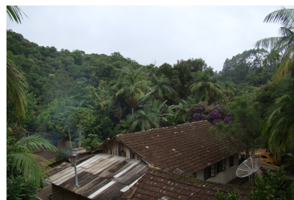
Figure 3 The palm E.edulis grown in homegardens in the community.

of fallow after swidden cultivation. These landscape units expanded in area after reduction of community agricultural activities in the late 1970s.