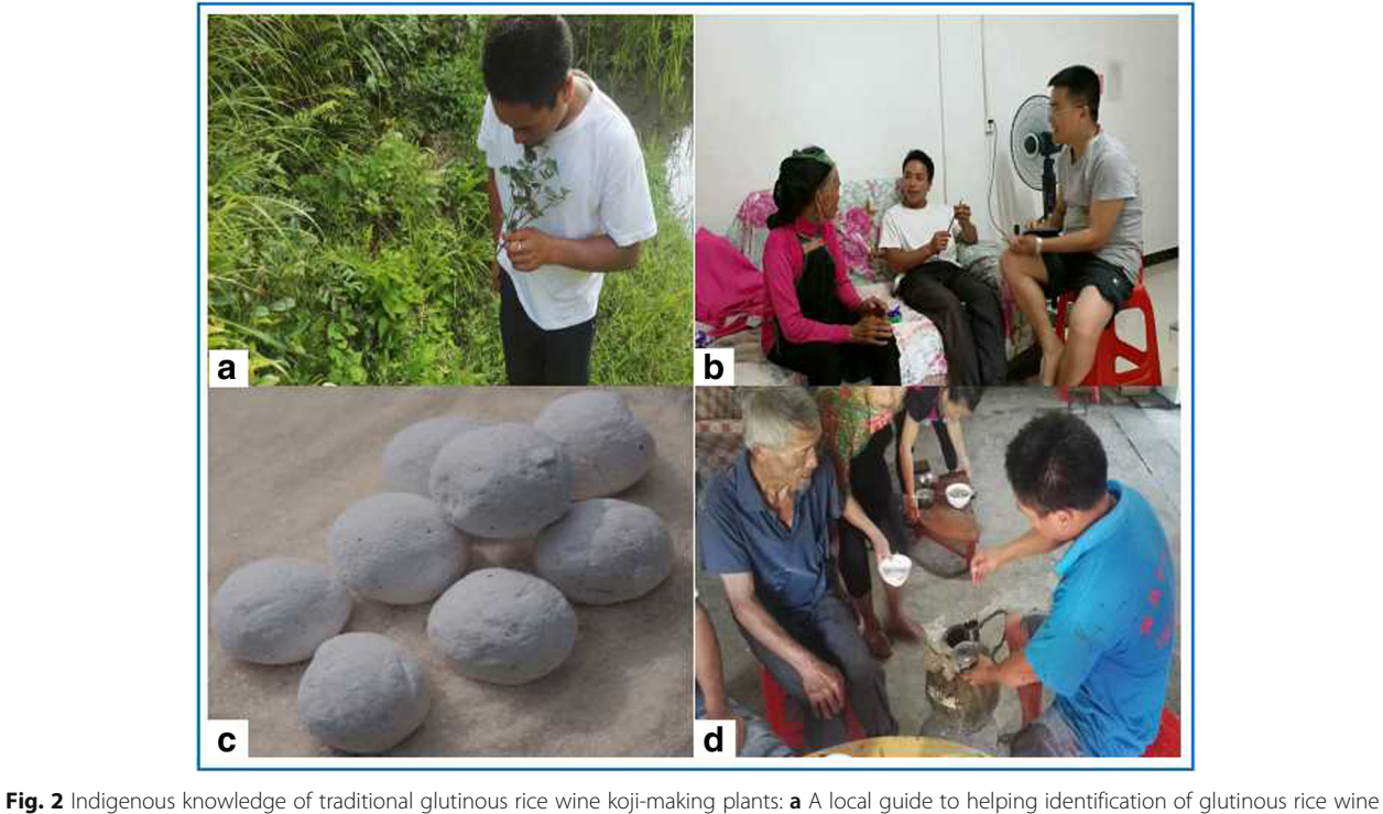
Fig. 2 Indigenous knowledge of traditional glutinous rice wine koji-making plants: a A local guide to helping identification of glutinous rice wine koji-making plants. b One of face-to-face interview. c The koji for brewing glutinous rice liquor/wine. d Glutinous rice wine made from koji

Table 2 describes the demographic characteristics of the 217 study informants. Informants comprised of 58.06% (N = 126) males and 41.94% (N = 91) females. In addition, informants were between the ages of 20 and 96 years (the