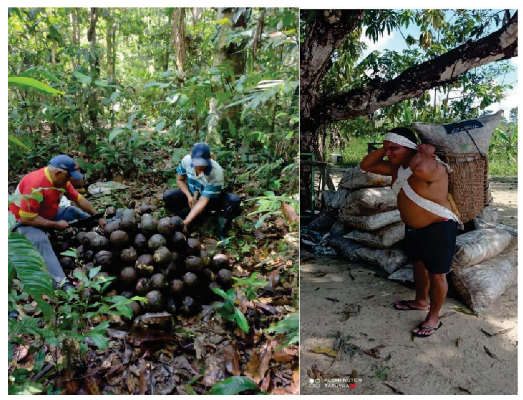
Fig. 2 Images (a, b) of the extractive activity of Brazil nut (B. excelsa) in the municipality of Caroebe, state of Roraima, Brazil.

difficulties inherent to the work. Others were unable to answer the question (16.7%):