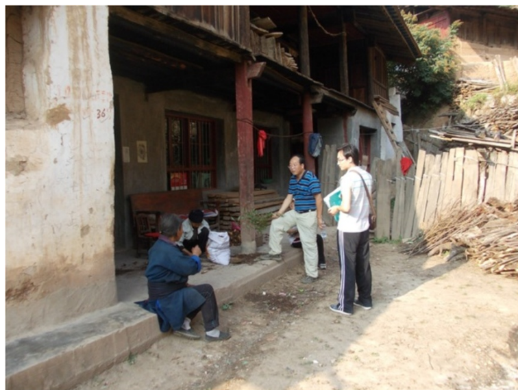
Figure 5 A typical two-storey house.

The studied valley is located along a small river, Gongba, which is a tributary of Bailongjiang (White Dragon River). Bailongjiang valley and its surrounding areas constitute a mountainous forefront of the Tibetan Plateau. We studied most Tibetan villages in two townships (镇 zhen ): Chagang and Wuping [29]. The two townships are located in the southwestern part of the Zhouqu country (Brugchu or Zhugqu in Tibetan), beside the upper Gongba River basin,