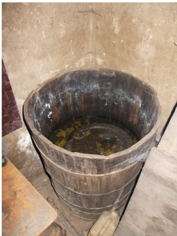
Figure 9 A barrel with lacto-fermented shoots of Helwingia japonica .

commonest plants in the roadsides) were widely used as emergency food and they are well remembered, although no one eats them nowadays.