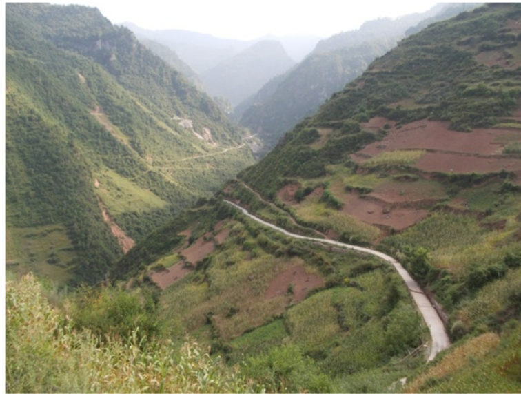
Figure 4 The landscape of Gongba valley around Chagang.

Autonomous Region was created where the Tibetan minority constitutes a large part of the population. Both the Chinese and Tibetans have a long history of settlement in this area as the region has formed a natural ethnic border between the Han Chinese and Tibetan speaking peoples [18].