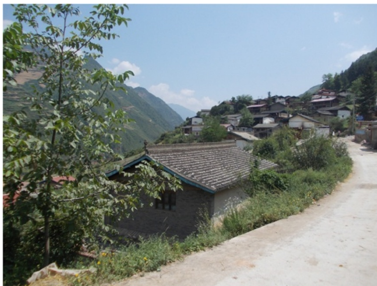
Figure 3 All the Tibetan villages in the valley are tight groups of homesteads located on hilltops.

The province of Gansu is located in northwest China, bordering Xinjiang and Qinghai in the west, Ningxia and Inner Mongolia in the north, Sichuan in the south and Shaanxi in the east (Figure 1). The vegetation changes from desert in the north and centre through dry grasslands to deciduous forests in the mountainous southern Gansu. In the south-west of Gansu, the Gannan Tibetan