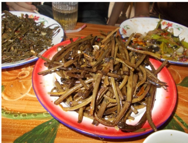
Figure 8 Lacto-fermented stalks of bracken fronds, served fried with chilli and pieces of bacon.

Wild vegetables are usually boiled and/or fried and served as side-dishes ( cai ). Wild fruits are collected mainly by children and eaten raw, they are not stored for further use. Mushrooms are usually fried. During the 1959–61 famine Sinacalia tangutica tubers (one of the