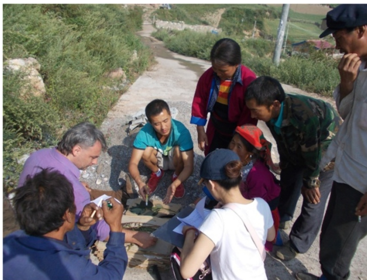
Figure 6 Local inhabitants eagerly took parts in interviews and specimen collection.

separated by massive mountain ranges both from the main part of Zhouqu country in the east and the Sichuan province in the southwest (Figures 2, 3 and 4).