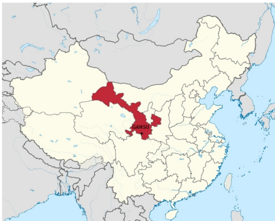
Figure 1 The location of the study area in China.

Although Tibetans are classified in China as one minority (藏族, Zangzu ), they consist of a mosaic of several Tibetan languages, dialects and ways of life, with six main groups/dialects, out of which three occur in China classified as Ü-Tsang, Kham and Amdo [23]. The linguistic situation on the Gansu – Sichuan border is little studied, and it is one of the regions in which ever newer dialects are described (e.g. [24]). Some linguists distinguish over twenty separate distinct languages in the Tibetan group of languages [25]. As Nicolas Tournandre puts it: “there are 220 ‘Tibetan dialects’ derived from