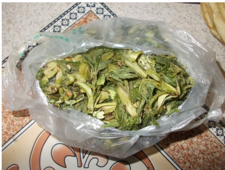
Figure 10 Freezing has recently become an alternative to lacto-fermenting or drying wild vegetables: frozen Eleuterococcus leaves.

The number of wild taxa eaten in the studied valley is relatively large compared to most studies around the world. However, compared to the northern slope of the Qinling, the list is shorter, in spite of the similar methodology applied and similar research effort involved