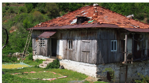
Figure 2 Typical Macedonian house inhabited nowadays only in the late spring and summer season in Gjinovec (1,252 m.a.s.l.).

belt, and by the Fagus sylvatica woodland belt at higher elevations. Sometimes it is possible to find some woodland fragments of Quercus cerris (in soil containing more clay) and Castanea sativa (in more acidic soil); in addition, there is some reforestation by Pinus nigra , probably carried out during the Communist period (1945–1991). The landscape is also covered by large extensions of secondary patches of semi-natural dry and humid grassland. A riparian marshy vegetation is found along the valleys, which is frequently fragmented and residual, dominated by some species of Salix , such as S. alba , S. eleagnos (sometimes really large) and, less frequently, S. purpurea . In the secondary succession, it is easy to find some different shrub species such as Corylus avellana , Cornus mas , Juniperus communis , Crataegus monogyna , Crataegus sericea and Juniperus oxycedrus . Up to the village of Klenje, within a high plateau, we could observe a large population of Prunus cocomilia .