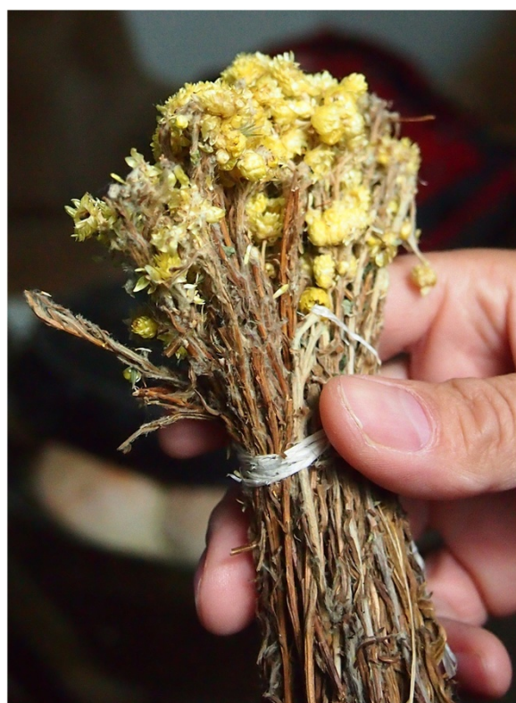
Figure 3 Dried flowering aerial parts of Helichrysum sp.

Within this ethnic group, this medicinal herb is the most frequently used remedy as it is applied in the treatment of many diseases as a kind of panacea. The high cultural consensus concerning the use of Helichrysum spp. in the Macedonian and Bulgarian medical folklore is remarkable in the scientific literature. A number of folk names referred to this taxon in Bulgarian retain the root “smil”, which has the meaning of physical beauty and health; moreover, in Bulgarian folk medicine, this taxon has been considered to be a real panacea and is often used for many purposes: as a diuretic, against dropsy, liver diseases, jaundice, stagnation of blood in the abdomen, tinnitus, low blood pressure, bone spikes, rheumatism, sciatica, rickets, worms, deafness and for treating skin diseases [64,65]. The ritual use of this plant in the South Slavic folklore is often linked to the bright yellow color of its flowers, which symbolizes sun and light, virginity, moral purity, and mercy in the Balkan folkloric tradition [66]. In Bulgaria, Helichrysum had to be collected in the morning of Georgyovden (corresponding to St. George's day, May 6 th ) and were sewn into the hem of garments as an amulet. In order to prevent jaundice in newborns, a bunch of Helichrysum was placed under the infant's pillow. The flowering aerial parts of this plant were used in wedding bouquets and the plant is mentioned in wedding songs and used as a sign of marriage [65,67].