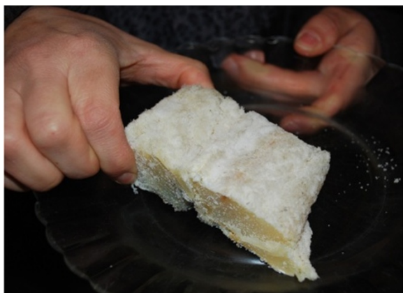
Figure 2 A bit of dried and salted cod. In Spain the “bacalao” is used in the culinary preparation of numerous and diverse traditional dishes. This product is consumed raw in salads, stewed or eaten fried.

Libra, the delivery will be made easier. The astrological systems used animal symbols to explain how different parts of the human body are related to illnesses. These human body-animal associations seem to have largely originated from sympathetic magic, whereby each animal possesses specific facilities which can justify their relation to a certain part of the body, to which their “virtue” would be transmitted. In the Old World, fish, recognised for the agility of their movements, were related to feet [98]. Accordingly Table 3 shows folk remedies for the treatment of gout and knee and foot joints pains ( Anguilla anguilla , Lophius piscatorius ).