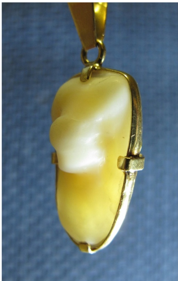
Figure 4 "Piedra de corvina" (meagre fish white stone). The otoliths of this fish species acquire a shape in which many people say that they see the face of the Virgin Mary, a fact that makes these mineral structures in a reputed protective amulet. In the pendant presented here we can see one of these otoliths mounted in gold. It belongs to the mother of one of the authors (JRV, Badajoz), who carries this jewel around her neck to prevent attacks of lumbago.

barbatus or M. surmuletus means that these species can be used for the treatment of menstrual disorders, and the form of the adhesive disc of the head of Remora remora explains its use in easing the implantation of the embryo in the uterus, as suggested in vernacular names "chupón", "chupona", "ventosa" (sucker, plunger, suction pad), typical of the Cádiz and Huelva coast [100].