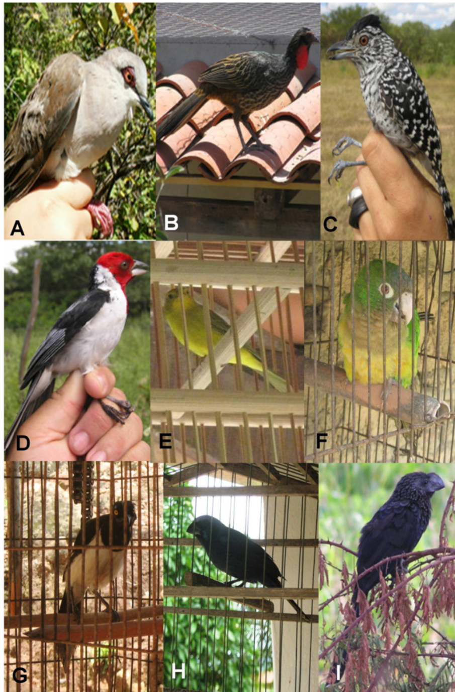
Figure 2 Some of the bird species captured by residents of Macaúba, Barbalha, Ceará for their meat: A – Leptotila verreauxi ; B - Penelope superciliaris ; C - Thamnophilus capistratus ; D - Paroaria dominicana ; E - Sicalis flaveola ; F – Eupsittula cactorum ; G – Cyanocorax cyanopogon ; H – Cyanoloxia brissonii ; I – Crotophaga ani .

other Brazilian localities [14,24,38]. In Bahia state, Costa-Neto [39] recorded the medicinal use of all three species cited in the present study. In two of these cases, only the feathers were exploited – those of C. cyanopogon for neurological problems, and of C. noctivagus for cases of epilepsy. The smooth-billed anu ( C. ani ) is used in two