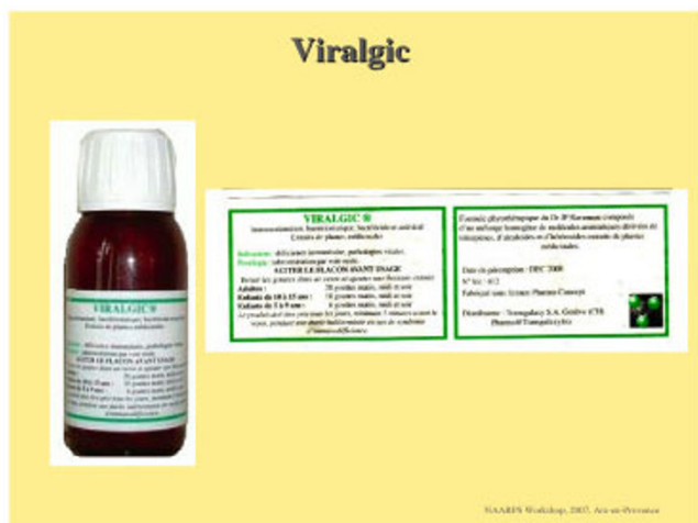
Figure 1 Viralgic, West Africa.

prescribe alternative products such as Immuboot (NHi2T) or Viralgic (Pharma Concept) (see Figure 1).