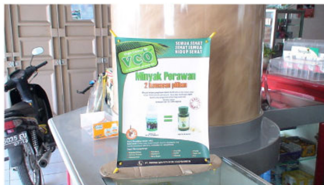
Figure 3 VCO, Indonesia.

Content analysis of the package information for VCO in Indonesia revealed that they are marketed as real 'cure-alls', i.e. to kill viruses and bacteria and/or strengthen the