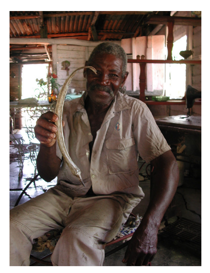
Figure 2 Haitian with a dried fruit of Abelmoschus esculentus from his homegarden (G. Volpato).

The present investigation shows that Haitian migrants and their descendants living in the Province of Camagüey (Cuba) have medicinal uses for 123 plant species belonging to 112 genera in 63 families. The most frequently used species are Chenopodium ambrosioides, Cissus verticillata, Cocos nucifera, Crescentia cujete, Cymbopogon citratus, Lippia alba, Momordica charantia, Pimenta dioica, Portulaca oleracea, Psidium guajava, and Stachytarpheta jamaicensis. Decoction of fresh herbal components (mainly leaves and other aerial parts) is the preferred means to prepare medicinal remedies. Herbal baths are important in Haitian culture in both spiritual and medicinal practices, and represent the second most important category of administration, after ingestion. Besides single medicinal plants, 22 herbal mixtures, mostly prepared as a concoction of plants or plant parts, are reported. Among these, a mixture prepared with the fruit of Crescentia cujete as a main ingredient is highly regarded by Haitians and is considered as a panacea.