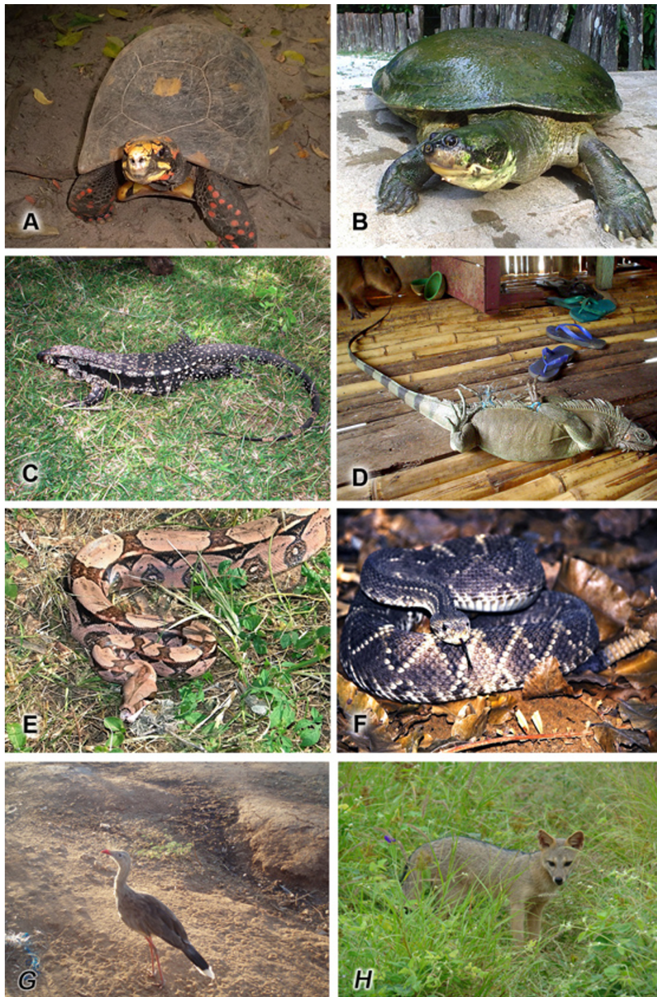
Figure 2 Examples of animals used as medicine in Latin America. A - Chelonoidis carbonaria , B - Podocnemis expansa , C - Tupinambis merianae , D - Iguana iguana , E - Boa constrictor , F - Caudisoma durissa , G - Cariama cristata , H - Cercocyon thous .

It is worth mentioning that such “natural modeling” does not necessarily preclude empirical efficacy. In Oxchuc, México, the two most common medicines given to speed delivery in cases of protracted labor are