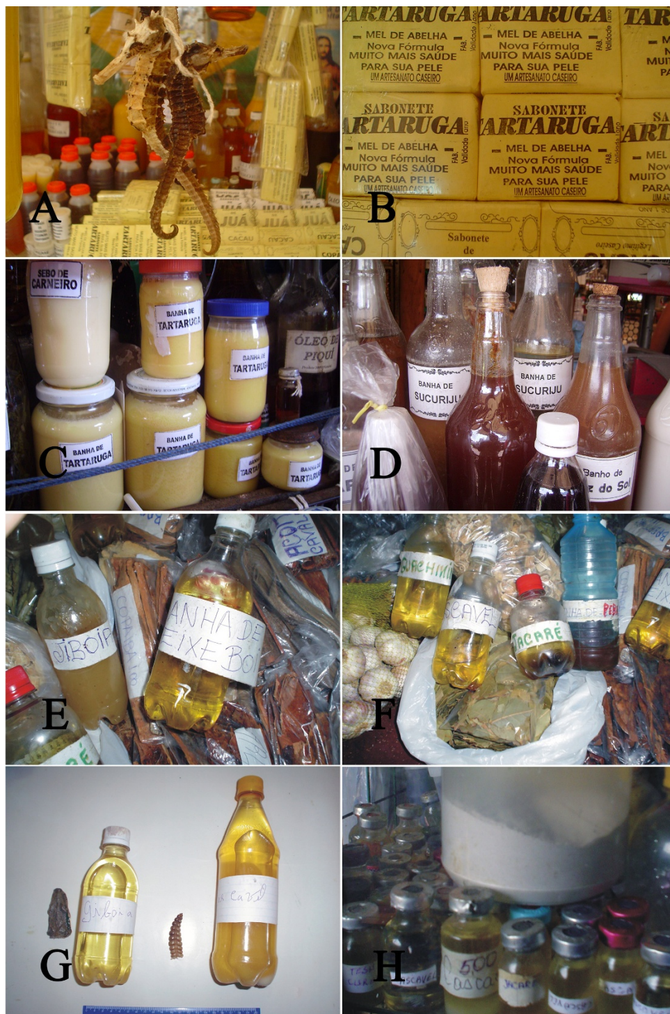
Figure 4 Medicinal animal products sold in Brazilian cities. A - Dried seahorses, B - Soap is produced from fat of turtle P. expansa and honey bee, C - Fat derived from sheep ( Ovis aries ) and Turtle ( P. expansa ), D - Anaconda fat ( Eunectes murinus ), E - Boa fats ( Boa constrictor ) and manatee ( Trichechus sp.), F - Plastic bottles with raccoon fat ( Procyon cancrivorus ), rattlesnake ( Caudisona durissa ), caymans ( Paleosuchus palpebrosus or Cayman crocodilus ) and armadillo ( Euphractus sexcintus ), G - Head and fat of boa ( B. constrictor ) and rattle and fat of rattlesnake ( C. durissa ), and H: Oyster powder ( Crassostrea rhizophorae ), fats of different animals prompt to be commercialized right in big pots of plastic and in small flasks.