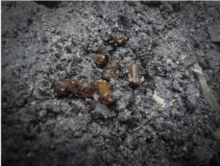
Figure 5 Feces of a female specimen of C. guanhumi , according to the collectors.

than females and will defend their burrows and small surrounding territories [48].