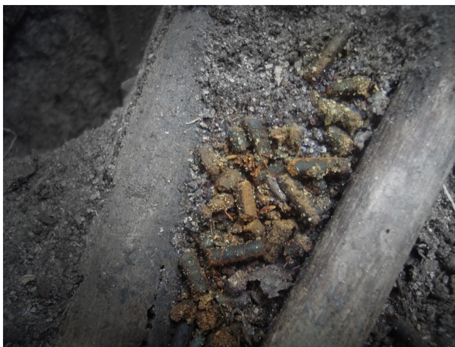
Figure 4 Feces of a male specimen of C. guanhumi , according to the collectors.