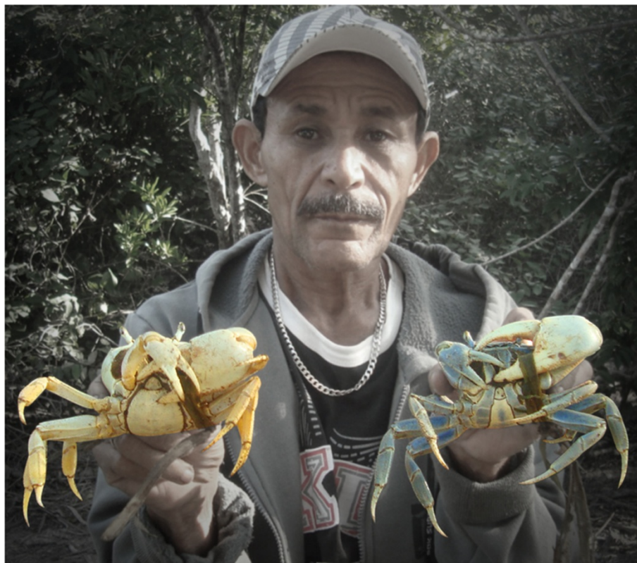
Figure 3 Collector showing sexual dimorphism of the species C. guanhumi .