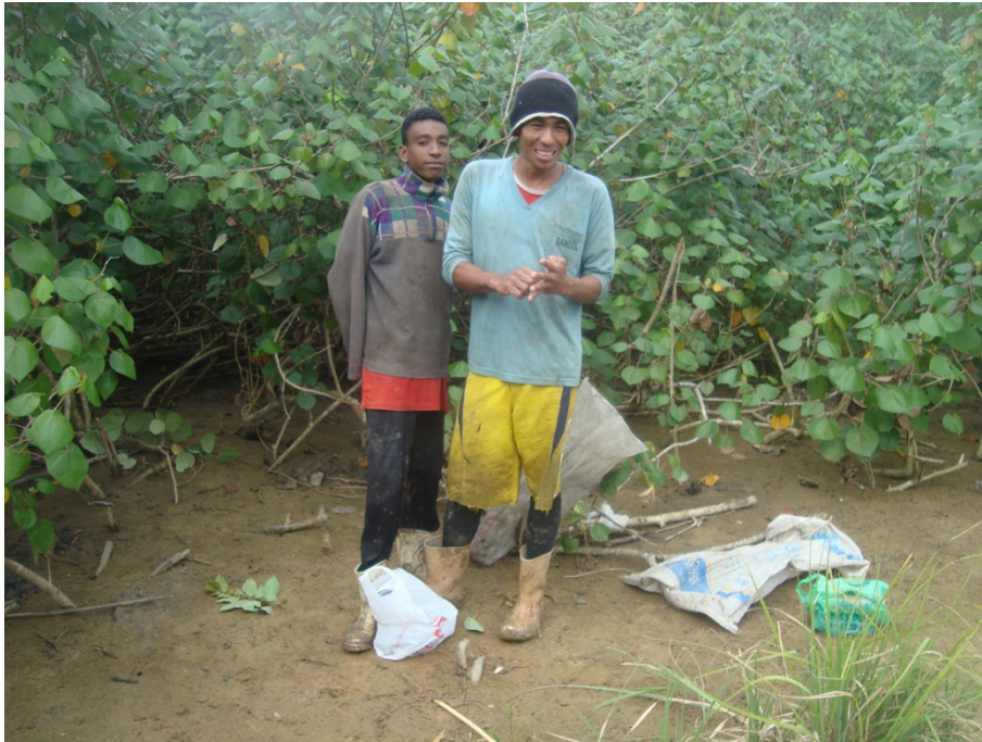
Figure 2 Crab Collectors in an “apicum” zone of the Mucuri mangrove.