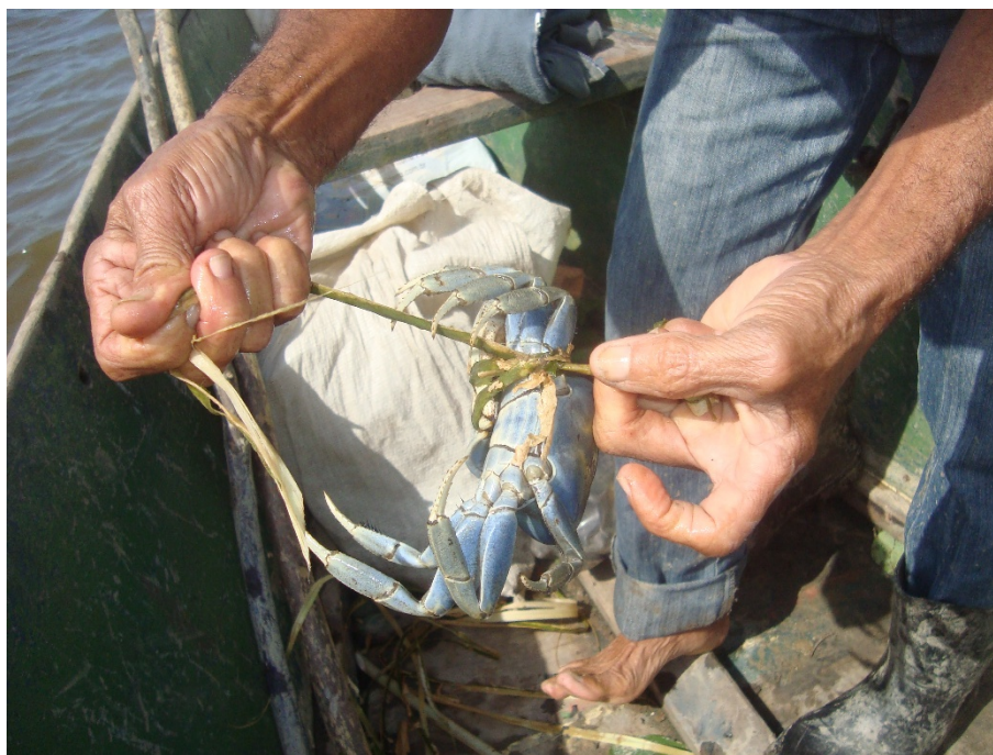
Figure 8 Collector using the “imbira” twine to bind the land crabs that are picked.

When questioned about capturing C. guanhumi during the period when harvesting is officially prohibited