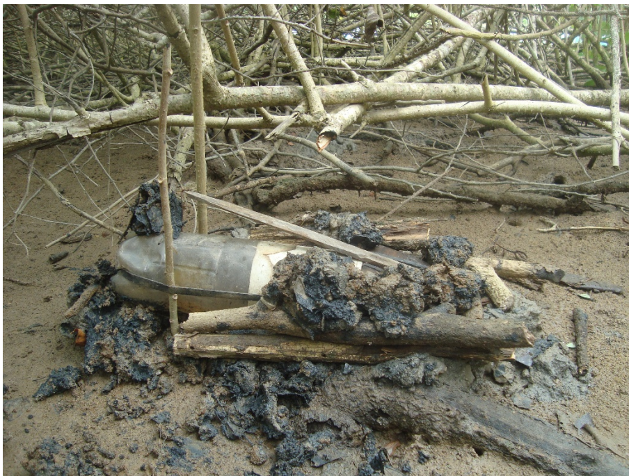
Figure 7 Rat trap currently used by the collectors and made from plastic bottles and PVC pipe.

dens and camouflage with leaves and mud (also fixing them to the sandy ground with sticks). The daily production of crabs is up to about 30 specimens per collector. The traps are generally set and then checked after