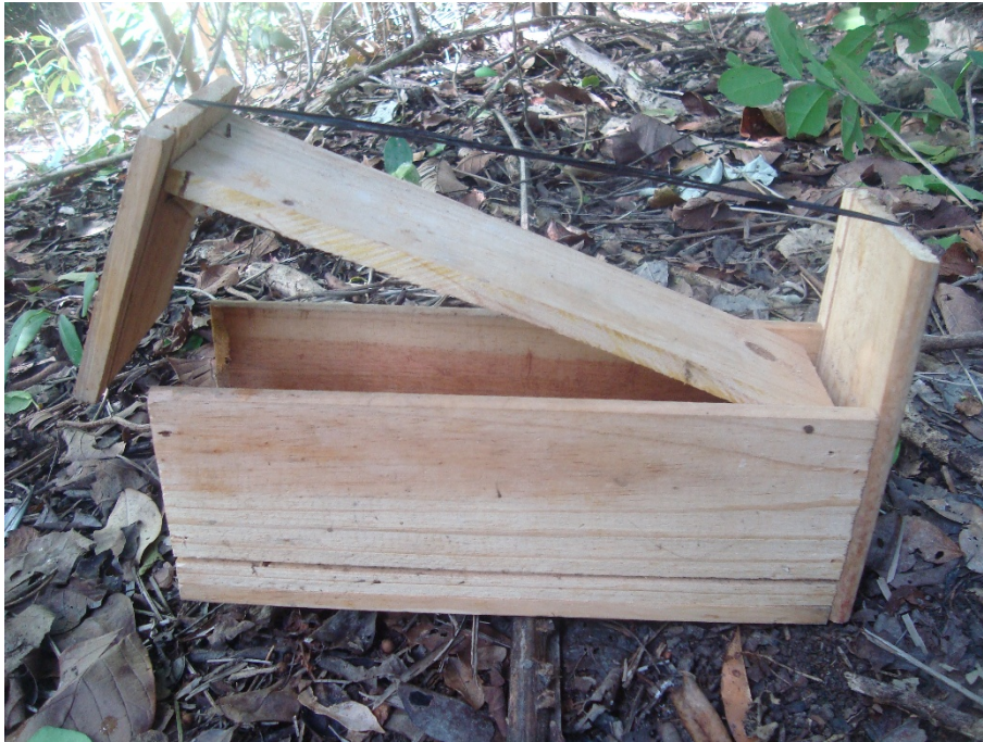
Figure 6 Rat trap ("ratoeira") used to capture C. guanhumi until 2002, made of wood.

by federal authorities in 1994, although they were legalized again in 2006.