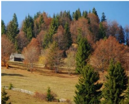
f, Bükkös: beech forest ( Symphyto cordati-Fagetum )