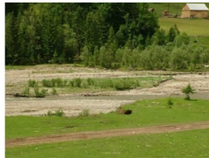
b, Porondos hely: young and old stream banks with gravel deposits ( Myricarium germanicae )