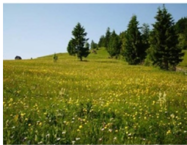
c , Kinnvaló kaszáló : outer meadow in the mountains ( Anthoxantho-Agrostietum capillaris )