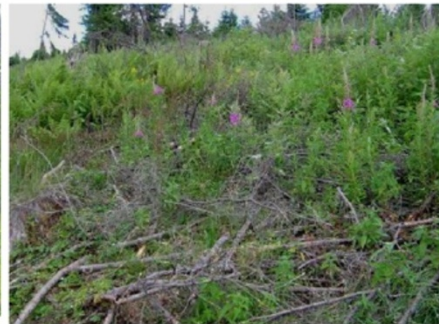
e, Vész: clear-cut area ( Rubetum idaei )