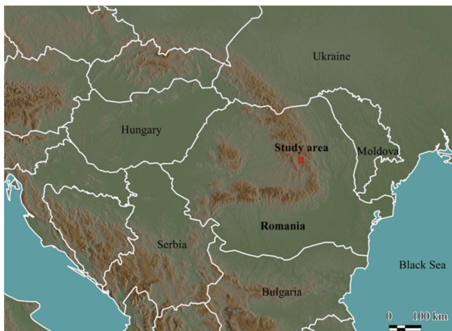
Figure 1 The study area - Gyimes - in the Eastern Carpathians, Romania, Central Europe.

The Gyimes Csángó is an ethnic group with about 14,000 members living in the valleys of the Tatros and its tributaries. Their native tongue is Hungarian. The