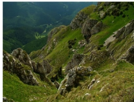
d, Szikla, kőpócok: cliffs and rocks