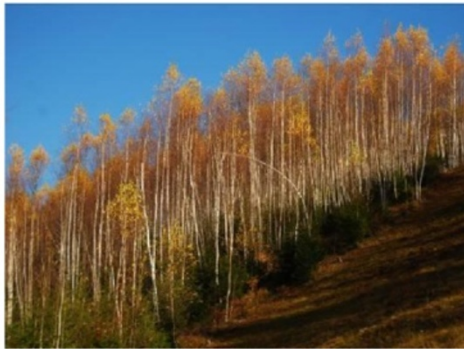
g, Nyíres: pioneer forest-stand dominated by Betula pendula