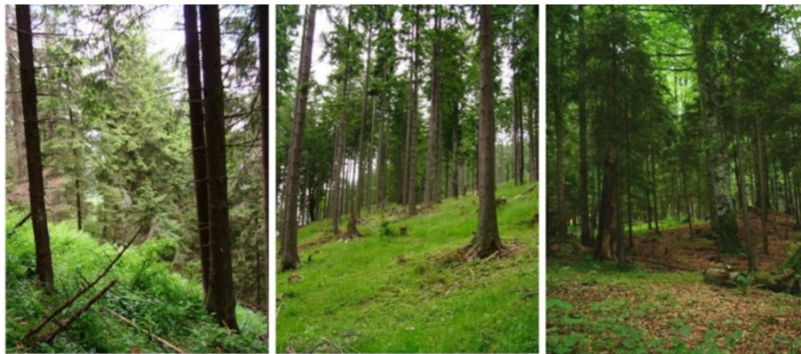
a, Öreg erdő: old spruce forest without logging and or grazing ( Hieracio rotundati-Piceetum )