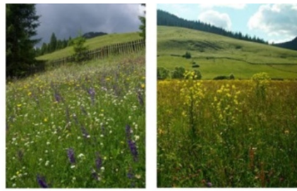
b , Bennvaló kaszáló inner meadows close to the valley bottom