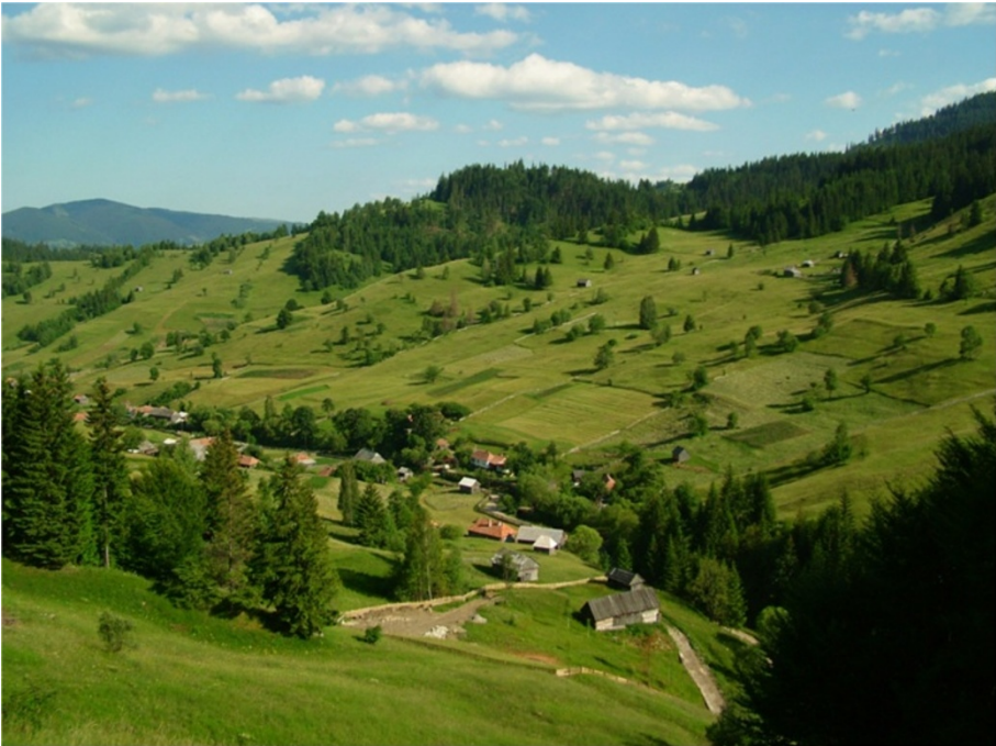
Figure 3 Inner hay meadows near the settlement, potato fields, houses and forests in Gyimes (Romania).