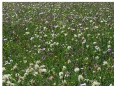
d , Kinnvaló kaszáló : outer meadow ( Anthoxantho-Agrostietum capillaris )