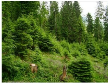
d, Bezseny: young, dense spruce forest ( Hieracio rotundati-Piceetum )