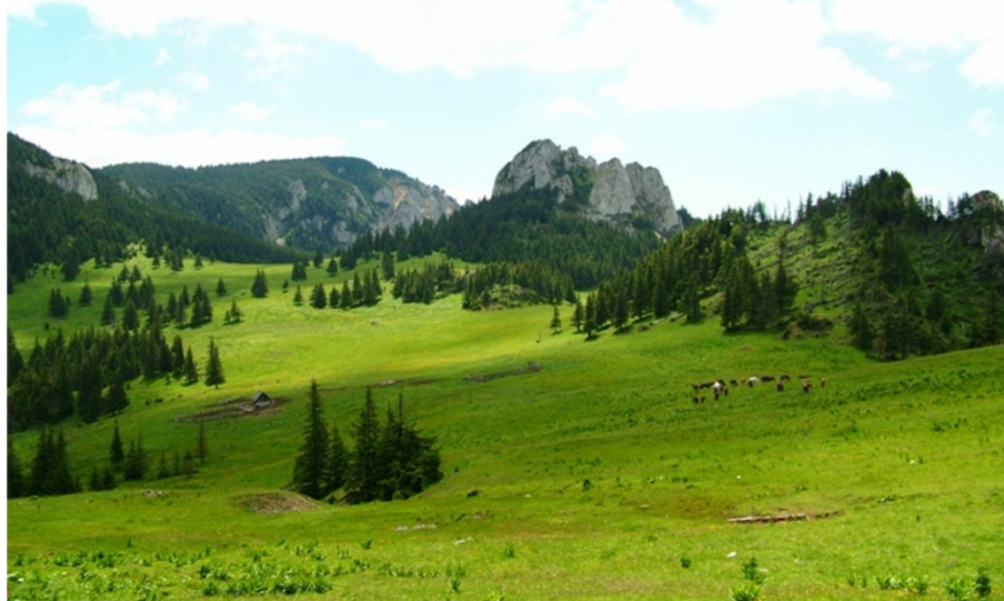
Figure 4 Mountain landscape with pastures, forests and rock outcrops in Gyimes (Romania).

Hungarian language is an agglutinative language that belongs to the Uralic language family. The Csángós in Gyimes speak a specific dialect (a transition between the Moldavian Csángó and the Transylvanian dialects). Their culture, particularly their dance and folk song culture, folklore, religious life, dress, characteristic life-style and customs, which were all in use until recently, have preserved a number of archaic elements see e.g. [40,43-45]. The local culture has been under transformation since the change in the political system in 1989, and increasingly depends on market conditions, while emigration has started. The delayed onset of cultural transformation was due to the minority status of the Csángó community. Preservation of the spoken language and the characteristic cultural traditions was an act strengthening local identity and expressing national identity of the community.