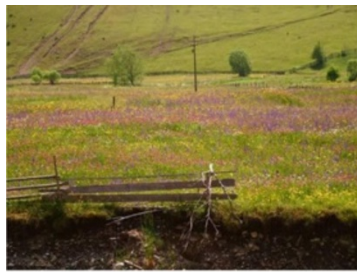
a , Bennvaló kaszáló : inner meadow close to settlement ( Arrhenatheretum elatioris )