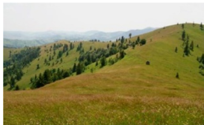
e , Hegyi kaszáló : outer hay meadows with scattered trees