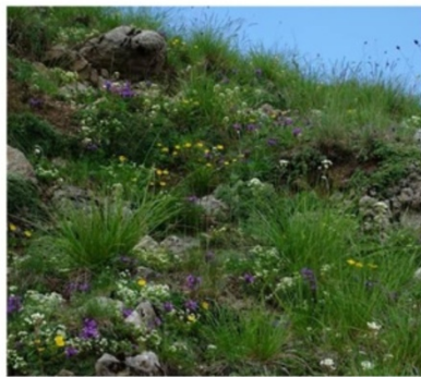
c, Köves hely: rock grassland at high elevation