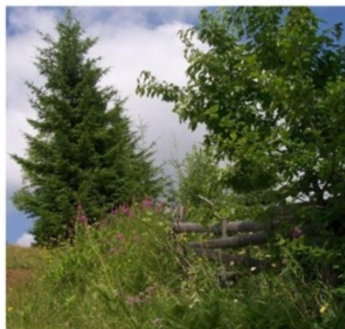
e, Kert mellyéke: tall herb vegetation along fences