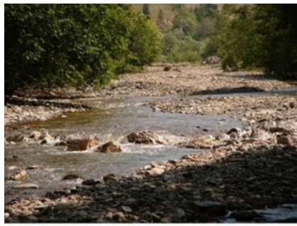
a, Patak mente: stream and its shore ( Salix trees, Alnetum incanae )