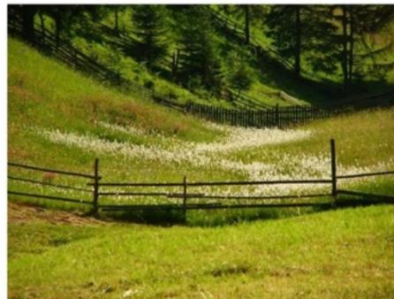
f, Selymék: rich fens in the valley bottom ( Eriophoretum latifolii )