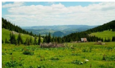
g , Hegyi reglő : mountain pasture with a mountain farm