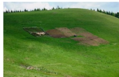
h , Johókosározott hely : place of present and former sheep corrals