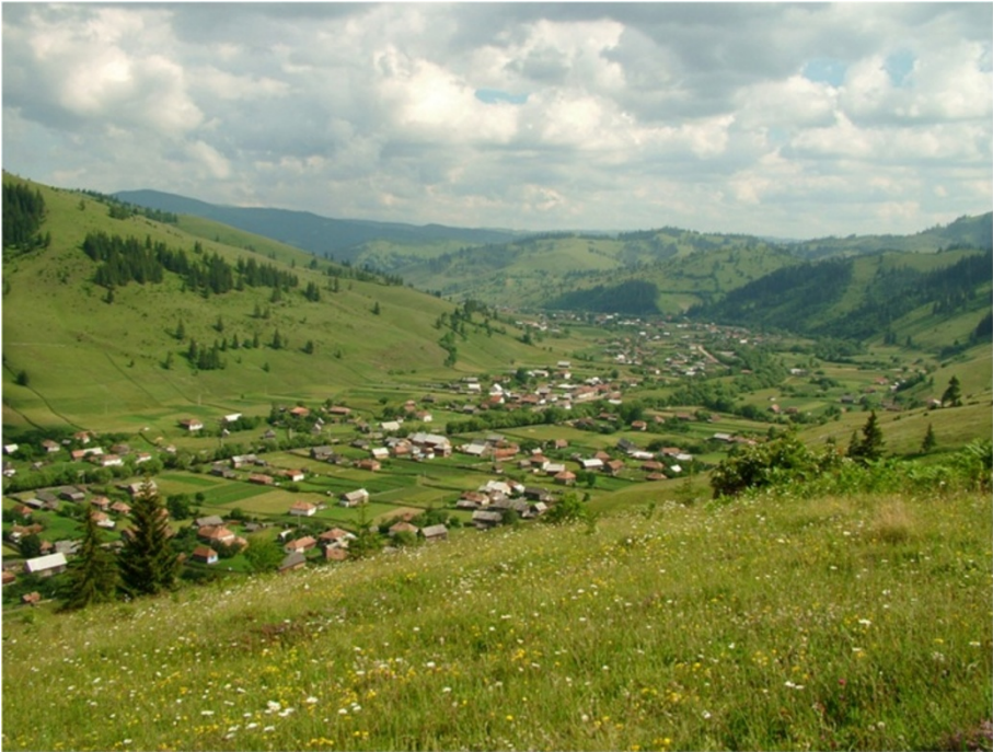
Figure 2 The valley bottom with the village in the study area.