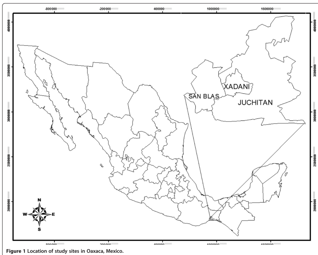
Figure 1 Location of study sites in Oaxaca, Mexico.

was 48.6 years old. We assumed that all interviewees may have had the same level of knowledge. All interviewees who participated in this study gave their previous informed consent to participate. Each of the 300 semi-structured interviews was conducted in Zapotec by the first author, a native Zapotec speaker. When the interviewees were not competent in Zapotec the interview was conducted in Spanish. We obtained the respondent's personal information including age, main occupational activity, number of