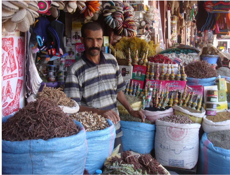
Figure 2 Bags containing single medicinal roots and herbal mixtures in the Marrakech herbal market (Photo: A. Ouarghidi).