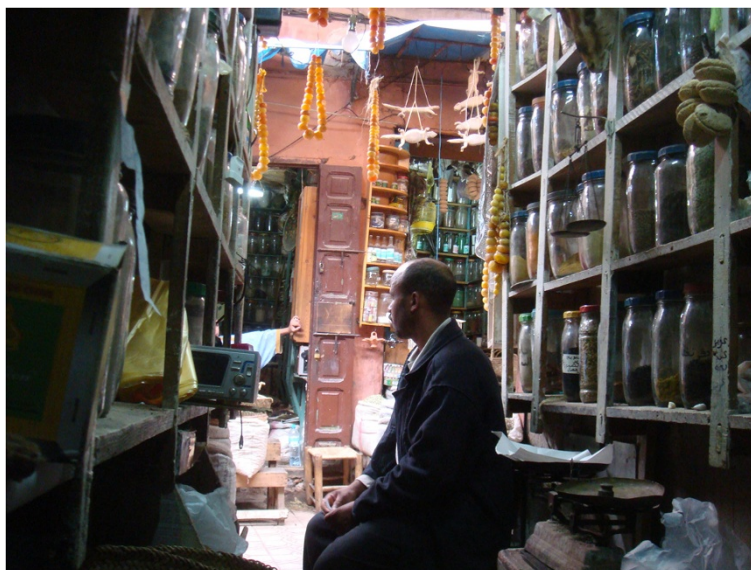
Figure 3 Herbalist's store in the Marrakech herbal market.

market chain to various collection sites in rural areas surrounding Marrakech. Twenty three collectors were identified and voucher specimens were collected with them during their normal collecting activities. Specimens matching local names were collected in each of the sites where collection was taking place (one or more specimens for each vernacular name). Botanical identification of plants was done by Abderrahim Ouarghidi, under the supervision of Dr Mohamed Ibn Tattou and Dr Mohamed Fennane from the Scientific Institute of Rabat (ISR). Collected vouchers were compared with specimens in the Herbarium of ISR. Flore de L'Afrique du Nord [9]