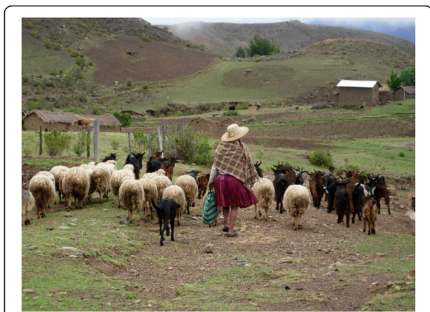
Figure 1 Livestock rearing.