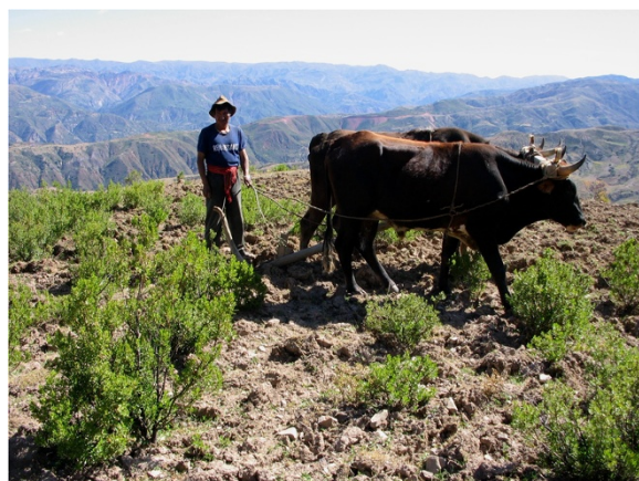
Figure 6 Importance of B. dracunculifolia for the restoration of soil fertility in fallow land.

Local people tended to give higher cultural importance to trees (e.g. S. molle ) than shrubs (e.g. L. graveolens ), as demonstrated by both ethnobotanical indices used (Composite S, CI) (Figure 5). This is supported by another study carried out in the same area [4] that revealed that sociocultural plant values increased with plant height and timber availability. This may be explained by the scarcity of timber needed for fuelwood and construction in the region. However, some frequently-growing shrubs such as B. dracunculifolia were also intensively used as fuelwood, for livestock fences, and in restoration of soil fertility in fallow land (Figure 6), and were thus highly valued by local people. This suggests that cultural importance and use-values of woody plants may not depend on their life-form only, but rather on their availability and accessibility (see also [4,8,9,46], especially in the case of frequently-used fuel plants [47]. Furthermore, plants' specific attributes (e.g. hard wood, tasty fruits) that exclusively meet important subsistence needs increase their cultural importance [10]. S. molle ,