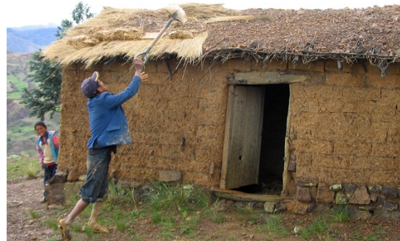
Figure 2 Repairation of roof cover by using woody branches, straw and loam.

dynamic values. They transform over time and thus may vary from one generation to the next due to abrupt or gradual changes in how people use or do not use plants in changing living conditions [10,35]. In the Bolivian highlands and lowlands, rural out-migration to urban centres strongly influences peasants' livelihoods. Young adults in particular migrate to seek better income and access to basic services such as healthcare, education, and infrastructure [36]. These processes can increase the generational differences in plant-related knowledge and valuation, and can also cause loss of traditional knowledge among the youth [37,38].