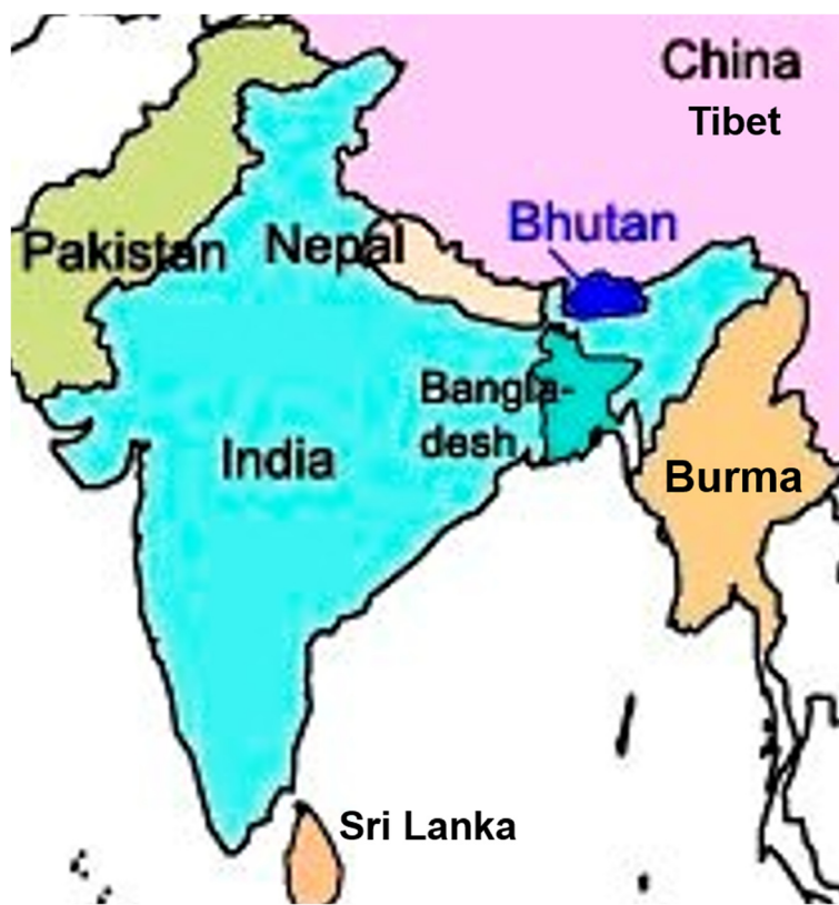
Fig. 1 Map of Bhutan [34]

navigating the biodiscovery projects in Bhutan. The paper also identifies research gaps, and suggest perspectives for future research.