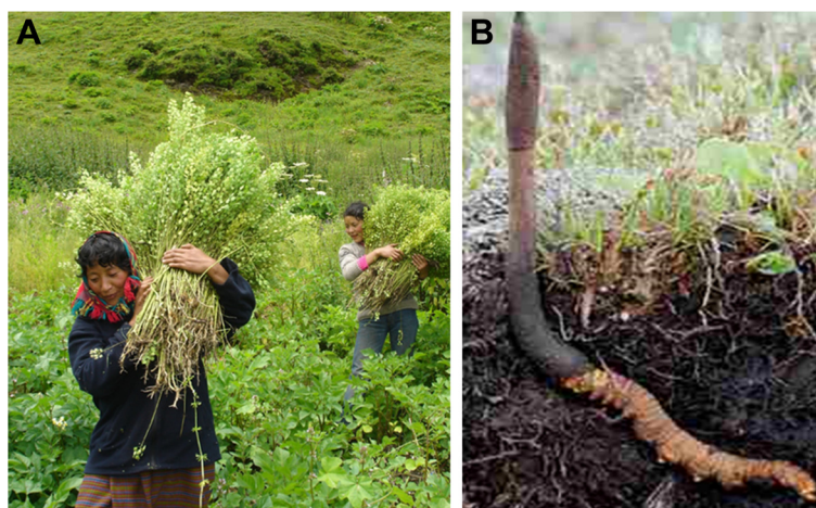
Fig. 3 a. Farmers collecting medicinal plants, b. Cordyceps sinensis

by the MSP comprises 100 Essential Traditional Prescription Medicines (ETPM) and 18 commercial products including different types of health promoting herbal teas and cordyplus products, varieties of incense and spiritual merchandises, massage oil and mind soother balm.