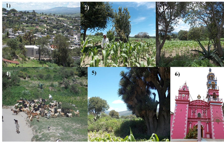
Fig. 2 Climate indicators at El Carmen Tequexquitla. 1) Carmen Tequexquitla landscape; 2) traditional agroforestry system; 3) maize cultivation associated with useful species for climate prediction, such as maguey and capulin ; 4) to contain cattle, a cattle herder enlist goats, an animal used as weather predictor; 5) the izote dominates the agricultural landscape at El Carmen Tequexquitla, and 6) The church of the “Virgen del Carmen”, a ritual space of great importance to peasants in the community

interviewees followed the “snowball method”, by which an informant or group of key informants lead to other individuals who possess information relevant to the study [34, 35]. Sample size was determined through “theoretical saturation”, which prevents data repetition and ensures its representativeness [36].