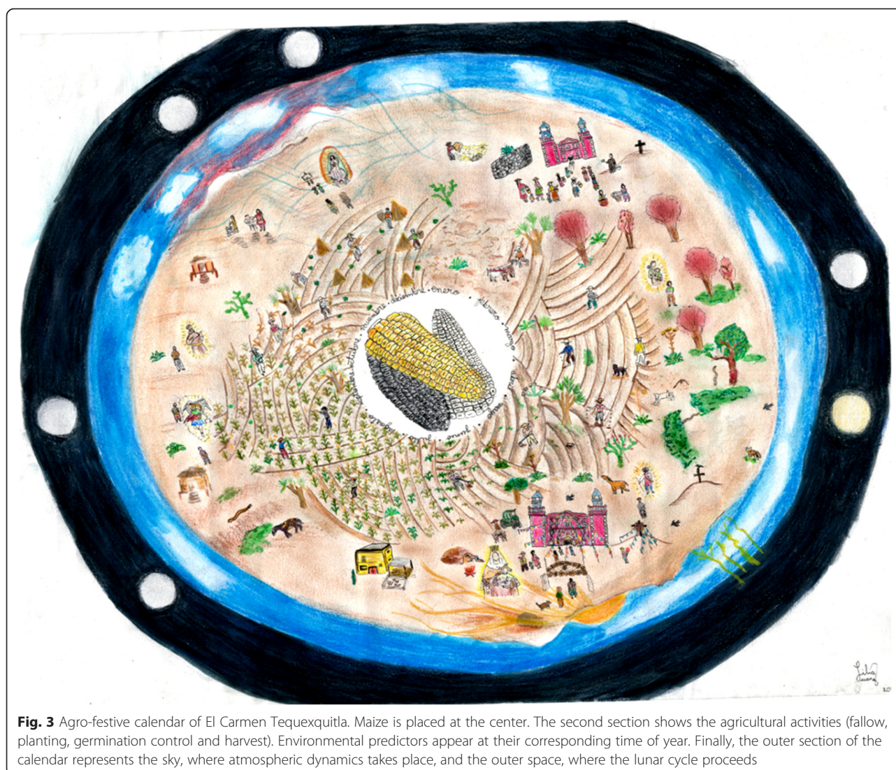
Fig. 3 Agro-festive calendar of El Carmen Tequexquitla. Maize is placed at the center. The second section shows the agricultural activities (fallow, planting, germination control and harvest). Environmental predictors appear at their corresponding time of year. Finally, the outer section of the calendar represents the sky, where atmospheric dynamics takes place, and the outer space, where the lunar cycle proceeds