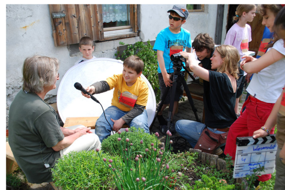
Fig. 3 Pupils interviewing local plant experts in their community. St. Gerold primary school

Children asked detailed questions when interviewing gatherers and tried to get information and understand processes involved in wild plant gathering. E.g. they asked exactly where and how to gather plants, how to use plants (e.g. making ointment, fumigate with roots) and what a plant or a special remedy is used for and how to use it. Several children also wanted to know from whom their interview partners have learned their plant knowledge. Children also asked what the interview