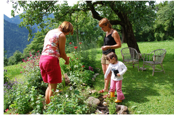
Fig. 6 Neighbours talk about herbs and their use in and around the garden. Farmer's garden in Blons

products themselves, such as syrup made from the flowers of the elder tree ( Sambucus nigra ). They were aware of this product from their childhood but had never prepared it. Through the children's activities and interest, the parents gained motivation for wild plant gathering and use. One elderly woman who collected herbs for the Bergtee association decided to stop her contribution one year. However the next year she brought a bag of dried herbs to the Bergtee leader again and explained that her grandson (a boy who was involved in the video workshops through the primary school in St. Gerold ) had become interested in plant gathering so she had to continue to teach him about the plants that can be gathered, plant uses, gathering locations etc.