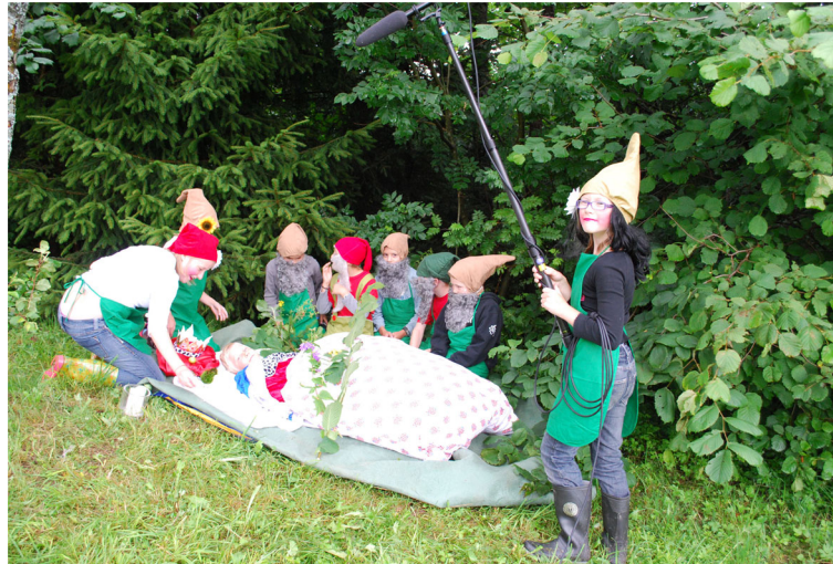
Fig. 4 Filming of the frame story. Summer workshop in the Grosses Walsertal Biosphere Reserve

partners like about gathering wild plants, making ointment or other herbal remedies and why they do it. They asked for special experiences connected to plants - also in the gatherer's childhood - and therefore inquired stories besides plant-based information. One sequence of the video was most exciting for the children as they commented themselves: digging Masterwort ( Peucedaneum osthrotium ) in an Alpine pasture and set it on fire for fumigation in a dark old stable was a real adventure.