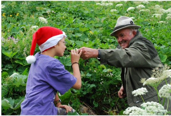
Fig. 5 Knowledge transmission: A local farmer shows the root of Masterwort. Participatory video workshop in the Grosses Walsertal Biosphere Reserve