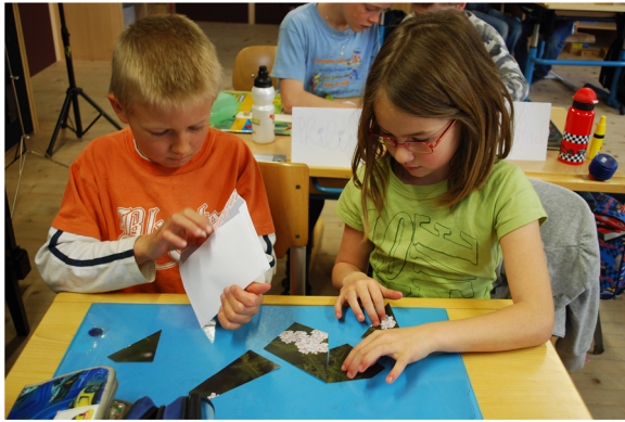
Fig. 1 Pupils compiling plant puzzles. School workshop in Blons

to all their classmates, explaining which plant species can be seen and what they know about them. Dried and fresh plants as well as products made out of them were then presented. For example, pupils could try a balsam made from Calendula officinalis , touch and smell different herbs such as Mentha sp. , or taste dried berries of Vaccinium myrtillus .