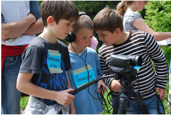
Fig. 2 Training with the video equipment. Introducing the workshop in the St. Gerold primary school

asked to bring costumes for the studio recording and come up with suggestions for a film title. This frame story was also filmed on the fifth day and a cover of the DVD box with contributions from each child was designed. The filmmaker gave the children insight into how editing works and they were to try this out for themselves on short sections.