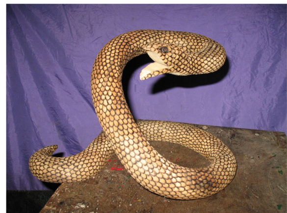
Fig. 4 Wood representation of the snake, made by the inhabitants of the area for the “Danza de los Negritos” in Cuetzalan del Progreso, Puebla

Results showed us that the traditional use of snakes is very wide, more than that reported by Martin del Campo [17] used by the natives in pre-Columbian times in the center of Mexico, and by Gutiérrez-Mayén [36] and Blanco-Casco et al. [51] in the study