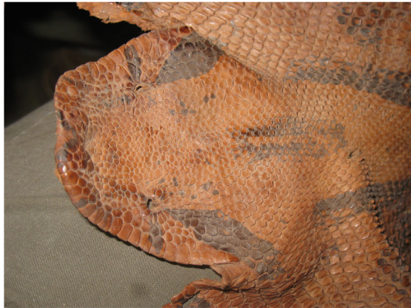
Fig. 3 Tanned skin of Boa imperator in possession of an inhabitant of San Miguel Tzinacapan, Cuetzalan del Progreso, Puebla

wander the surroundings, and when they find a snake, they usually kill it. A great part of the interviewees ( n = 36 ), mentioned sacrificing snakes because they are harmful, aggressive and poisonous. Most of the villagers mentioned that snakes are killed with a knife, and the animal is taken far away so that the bones do not infect a passer barefoot, or they also tend to put the snake inside a sack once it's dead, being very careful with its fangs because of the poison. If the snake they encounter is Boa imperator or Bothrops asper , they use the skin, but if it's any other species, they dispose of it far away. Snakes are also